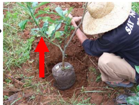
Step 2: Adjust seedling for being straight and vertical