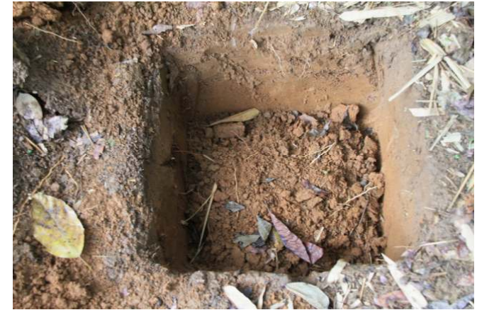
A hole ready for planting fruit tree