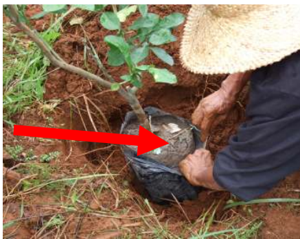
Step 1: Tear the container

- Plant the trees in shading time (early morning or late afternoon).