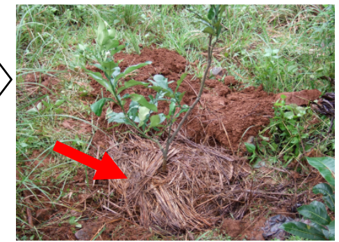
Step 4: Cover the tree's base with rice straw, fodder grass