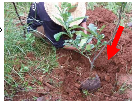
Step 3: Backfill the hole