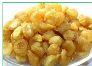
Dry longan flesh