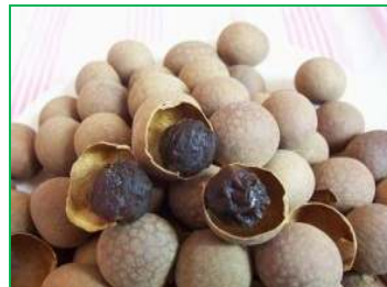
Dry longan fruit