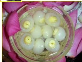
Longan fruit and lotus seed