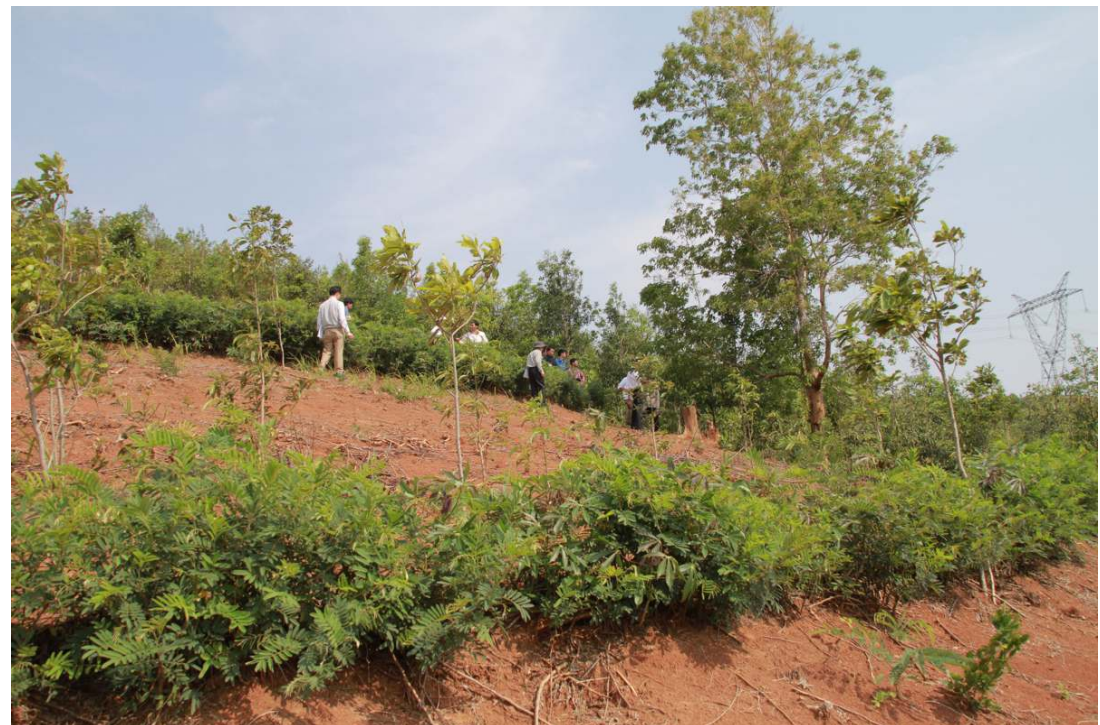
Contour line plantation to prevent soil erosion

The above practice will be repeated until the 3 rd delivery. Thereafter, the household will be allowed to keep the sow and all the piglets.