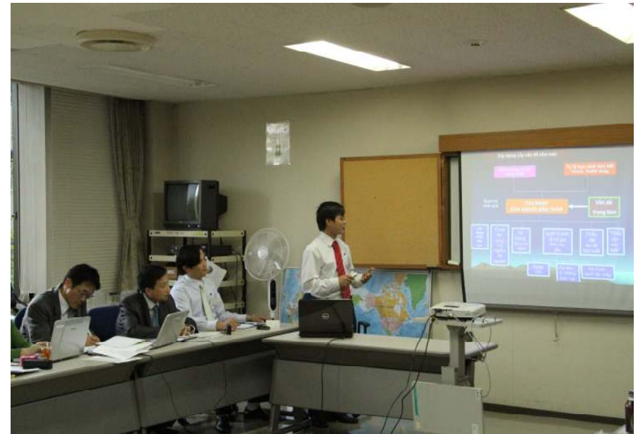
Participants are presenting their learned lesson and applied activities

Livelihood development and life improvement