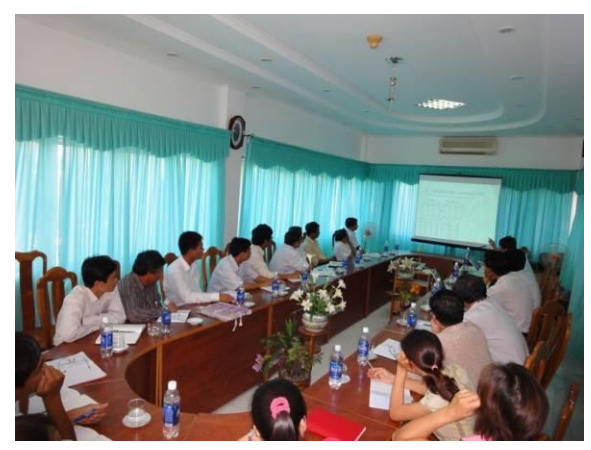
Seminar for Climate Change (Da Nang)

In this flood simulation, the change of precipitation after a climate change will be taken into consideration. One expert of climate change came to Vietnam and elaborated precipitation value which will be used in the simulation. Further, this expert held one seminar for climate change and had a discussion with Vietnamese experts.