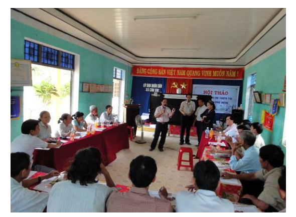
BDRM Workshop (Kam Kin, Quang Nam)

Future activities in the pilot project communes shall be conducted from August to September. In the future activities, second workshops and evacuation drills aiming at the reduction of disaster risk shall be conducted.