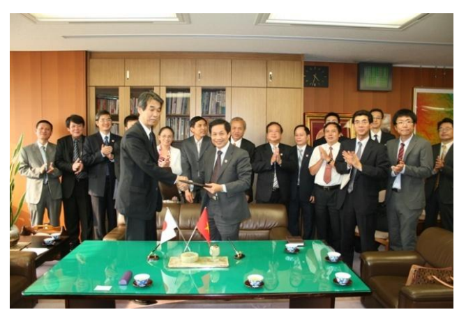
Shaking hands after signing of the Minutes (at MLITT)