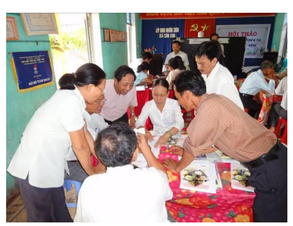
BDRM Workshop (Kam Kin, Quang Nam)