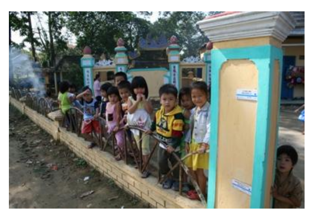
Flood Mark Plate and Children