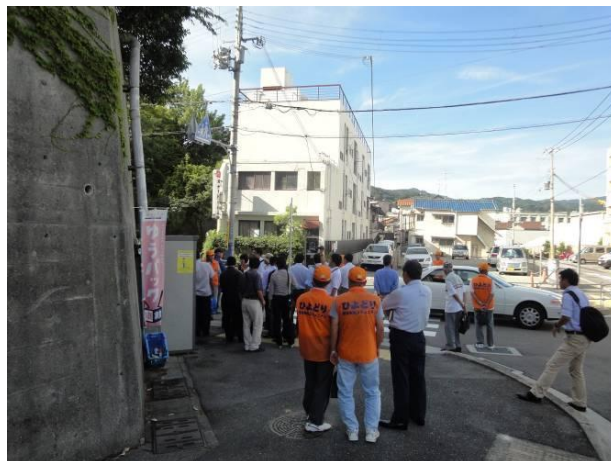
Visiting Hiyodori town