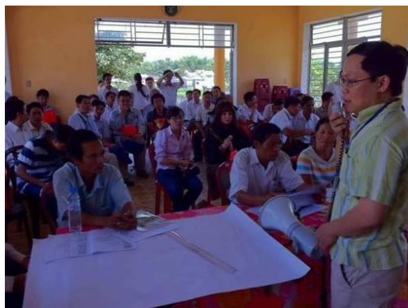
Visiting Community Disaster program