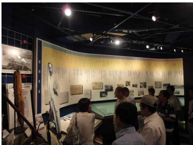
Yodo river museum

Trainees learned river management history and facilities in the Yodo river at the Yodo river management office and Yodo river museum. The Yodo river has a very old history of river management and struggled with floods in recent years. The condition and the problem of environment / flood of the Yodo river is similar to the river in Central Vietnam. An active discussion was held between Japanese and Vietnamese.