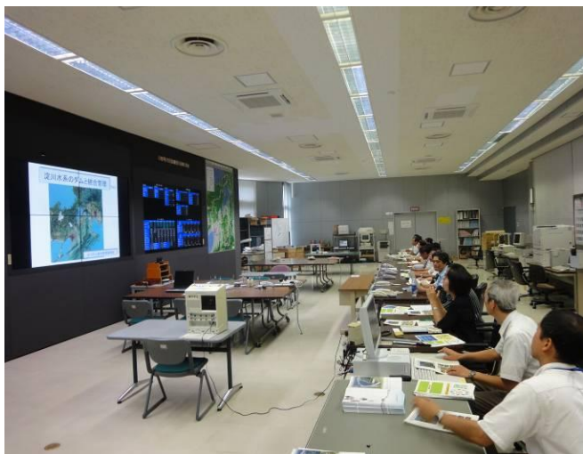
Lecture at Yodo river integrated dam management office

A lecture for integrated dam management at the Yodo River Integrated Dam Management Office and a visit to Amagase Dam was held. Recently, dam management for flood control has become a big issue in central Vietnam. This training will be a very useful for the trainees.