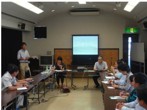
Lecture at Uozakitown