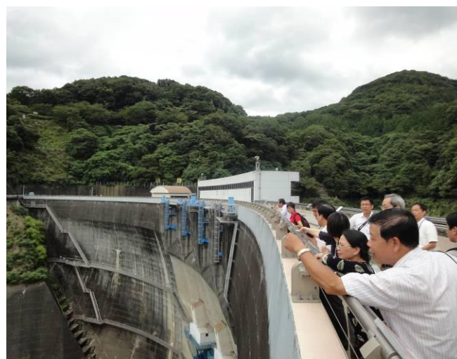
Visiting to Amagase Dam