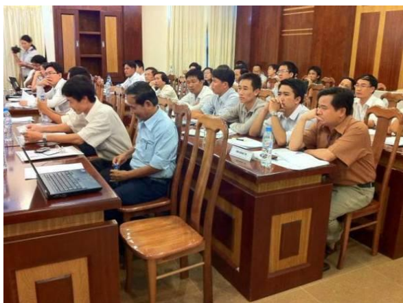
Attendants from Central Vietnam

A general training workshop was held on July 26 and 27 under the cooperation of DMC (Disaster Management Center), MARD and JICA expert team. The workshop is composed of three themes which are: 1) Flood simulation and hazard mapping, 2) Community disaster management and 3) Low cost and small scale river bank management. In the workshop, site visiting was held to see the situation of community disaster management and river bank protection in pilot sites. Sixty four engineers mainly from 19 provinces in central Vietnam attended this workshop and had meaningful discussions during the two days.