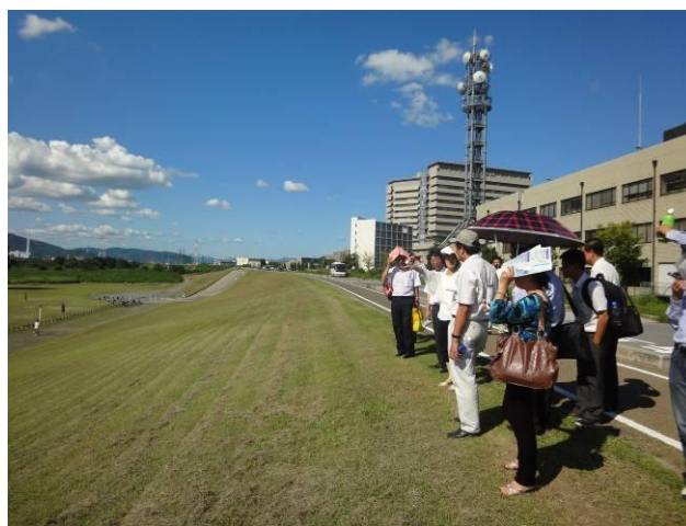
Left bank of Yodo river (Hirakata)