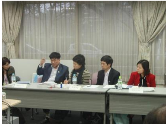
Above: 3 DCPC officials listen to a lecture Below: Sharing opinions and experiences