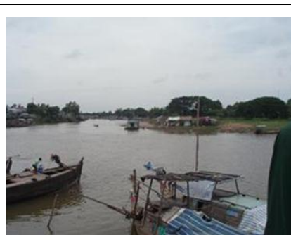
Above: The border (Cambodia lies on the other side of the river) Right: Working Group meeting at DOLISA

Women and girls accounted for 75% of TIP victims during the reporting period. The number of child victims (27%) increased seven percentage points from the last reporting period, 2003–2006. Africa has the highest proportion of child victims, 68%, followed by Southeast and South Asia, with 39%.