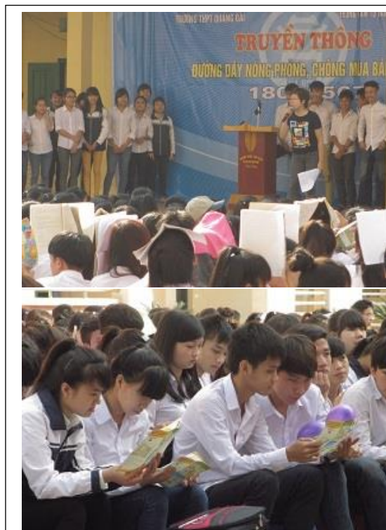
Above: Hotline counsellors in action Below: Students reading the Hotline leaflet

Other articles of this Decree related to women workers,