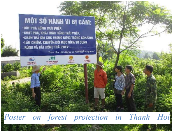
Poster on forest protection in Thanh Hoi