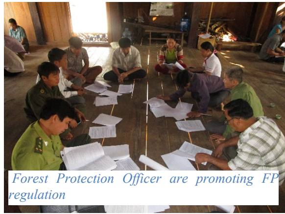
Forest Protection Officer are promoting FP regulation

In order to ensure that the effective operation, each VFPT has a clear and transparent operational regulation, developed with the participation of most households. In order to augment the capacity of VFPTs, SNRM organized training courses and a study-tour and supplied with essential equipment such as maps, binoculars, compasses, and uniforms.