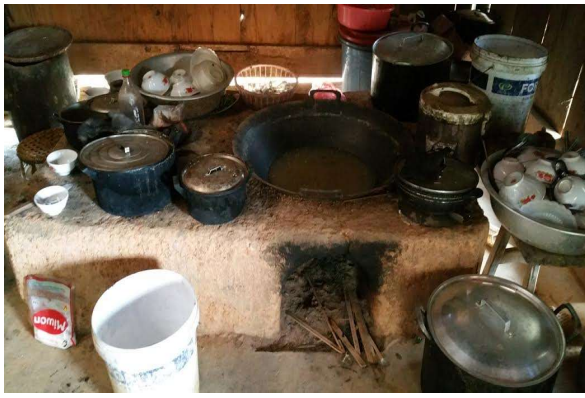
Photo 13: Traditional improved cooking stove in Hmong village. Suitable for a large fry pan. Air and fuelwood supply are from the same hole.