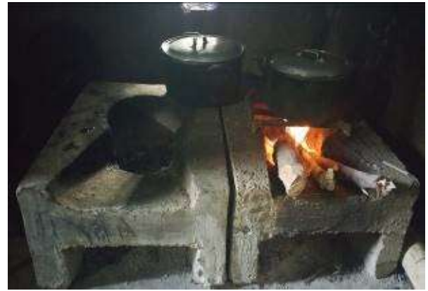
Photo 14: ICS made by a handy villager inspired by SNRM ICS. Similar design. Left is for a smaller pan and the right is for a larger pan with straight design.