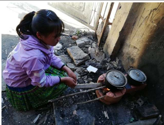
Photo 5: ICS (two pan model) made in Vinh Phuc Province. Portable and small. Provided to a boarding school.