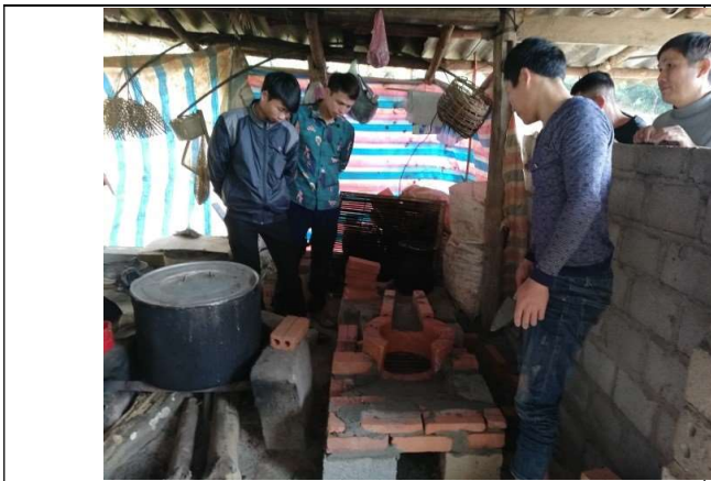
Photo 15: Larger ICS making with fire clay brought from Vinh Phuc Province. Fuelwood supply is from upper part. Second pan is set behind.