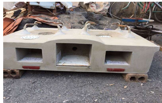
Photo 12: ICS available in Muong Gion commune (made in Quynh Nhai center). It is made of cement and has a large hole in the middle for an electric fan to provide air to two pans. There are two drawers under the hole.