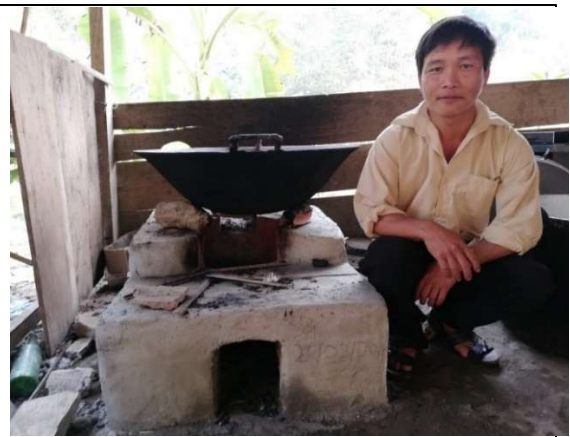
Photo 16: Larger ICS made with fire clay by H'Mong villagers. Fuelwood supply from upper part. Smaller hole in the bottom for air. A large pan is placed on stone.