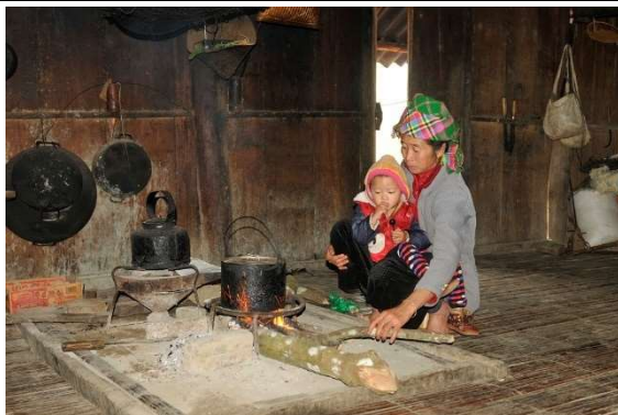
Photo 1: Traditional open cooking with metal frame in a kitchen inside house. Adjustable with larger fuelwood