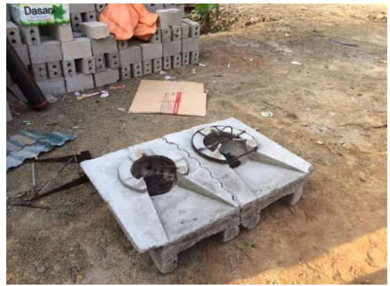
Photo 10: ICS provided by SNRM with molds. Dividable into two parts. Larger two holes for air entry and fuelwood on the top. No additional air hole in the middle. Sustaining iron crutch is rather low because of the open space in front.