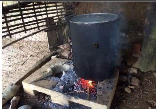
Photo 11: ICS provided by SNRM being used for larger pan (animal feed making). The stove is placed on the ground.