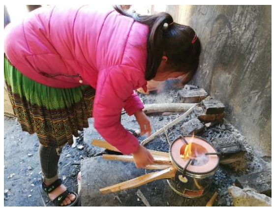
Photo 4: Portable ICS made in Vinh Phuc province. For small cooking with smaller fuelwood. Provided to a boarding school.