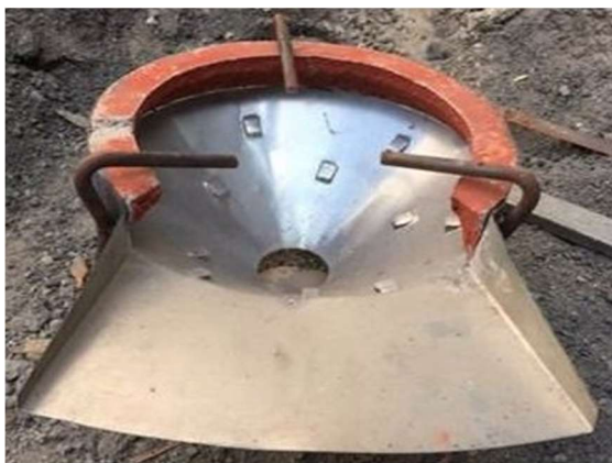
Photo 7: ICS in the market of Son La. It is rather small and placing fuelwood on the top.