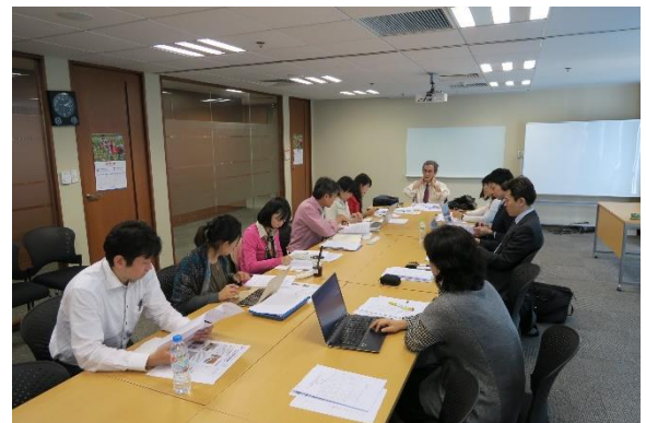
Exchange of information on health sector at JICA Viet Nam Office