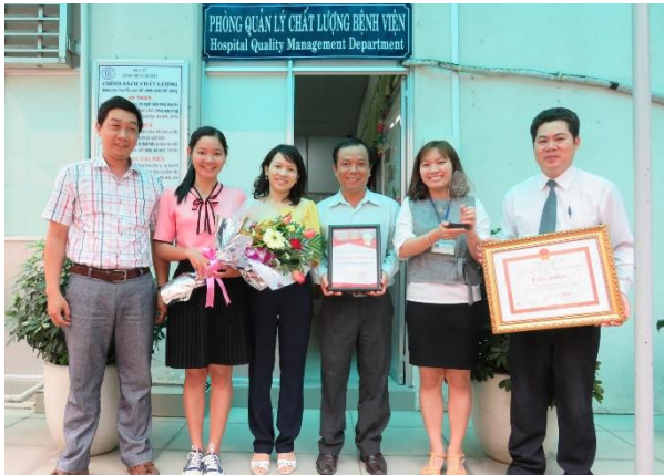
Taking a ceremonial photo with the members of the Quality Management Department

It is notable that Cho Ray Hospital was commended for its outstanding achievement in the quality management by the People's Committee of Ho Chi Minh City.