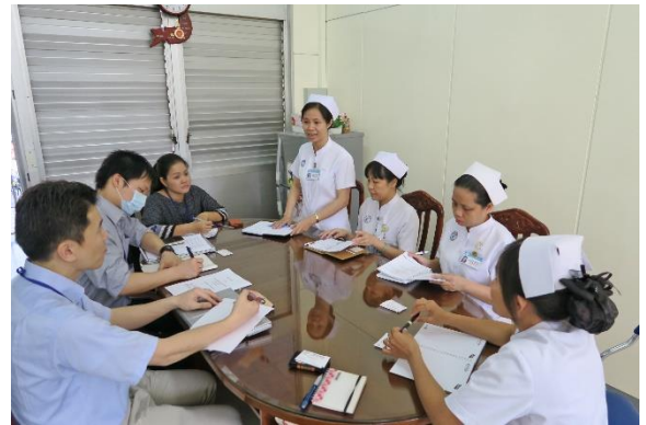
Meeting with the Nursing Department

The Japanese experts has been talking with the Nursing Department, the Infection Control Department,