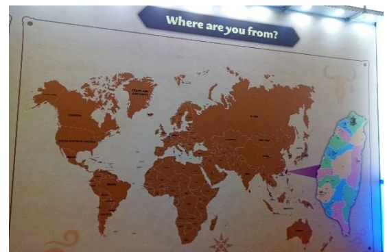
World map board to mark the participants' countries