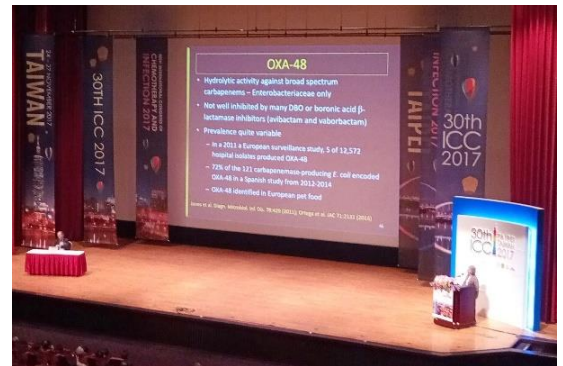
The main venue of ICC 2017