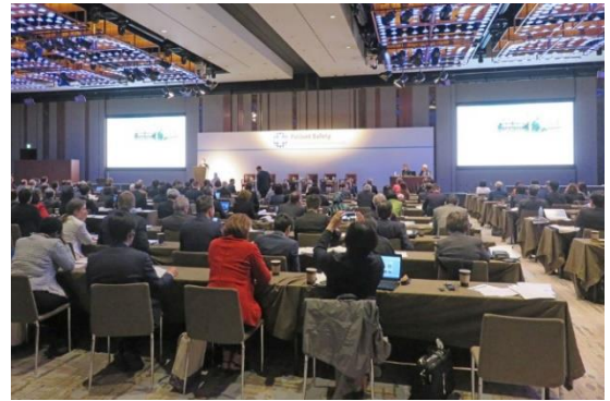
The venue of the Summit (Grand Hyatt Tokyo)