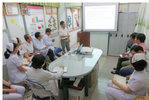
Reporting the result of the rounds

We discussed the result of the rounds, specifically on the 38 patients observed, at the RST meeting in March and found some challenges such as intubation tube fixation, cuff pressure control, bed angle, ventilator management, pressure ulcer management, etc.