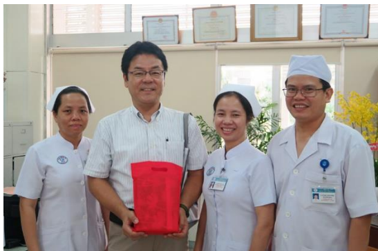
With the staff of Nursing Department

Since then, I always felt the deep trust and friendship of the staff of Cho Ray Hospital to us Japanese while I worked in the Project.