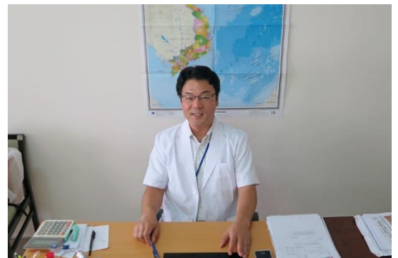
At the Project office

I think we should remember that the trust and friendship are the result of the 50 years of efforts by a lot of predecessors of both Cho Ray Hospital and Japanese side.