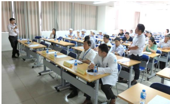
Discussion with participants