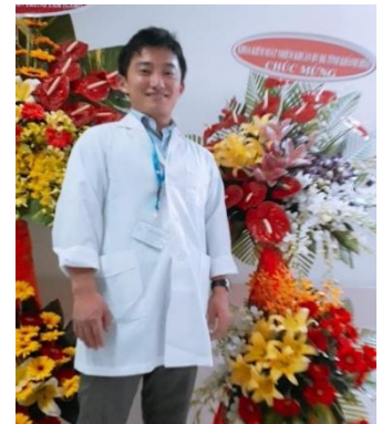
At opening ceremony for Central Sterile Supply Department