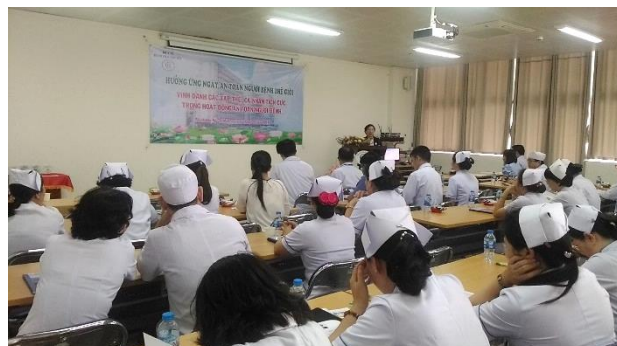
Patient Safety Day Event