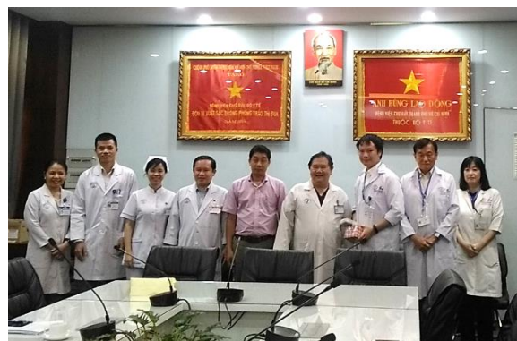
Greeting to the counterparts

I would like to express my deep appreciation to everyone at your company for the kindness I received during my term (from 5 th January , 2017 to October 5, 2019). Strengthening patient safety system such as human resource development on patient safety, multidisciplinary teams approach and developing clinical pathway are big challenges in Vietnam. However, due to the support and efforts of counterparts, the system has been improving. I am proud to have the opportunity to work with you all. Thank you very much for all staff in Cho Ray Hospital. I pray for your happiness and continued success. See you soon!