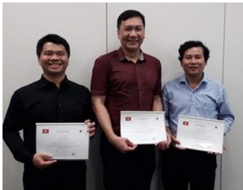
Closing ceremony at JICA headquarters

In addition, we conducted practical training using antimicrobial resistance strains at Cho Ray Hospital that were sent before visiting Japan and confirmed the detailed test results.