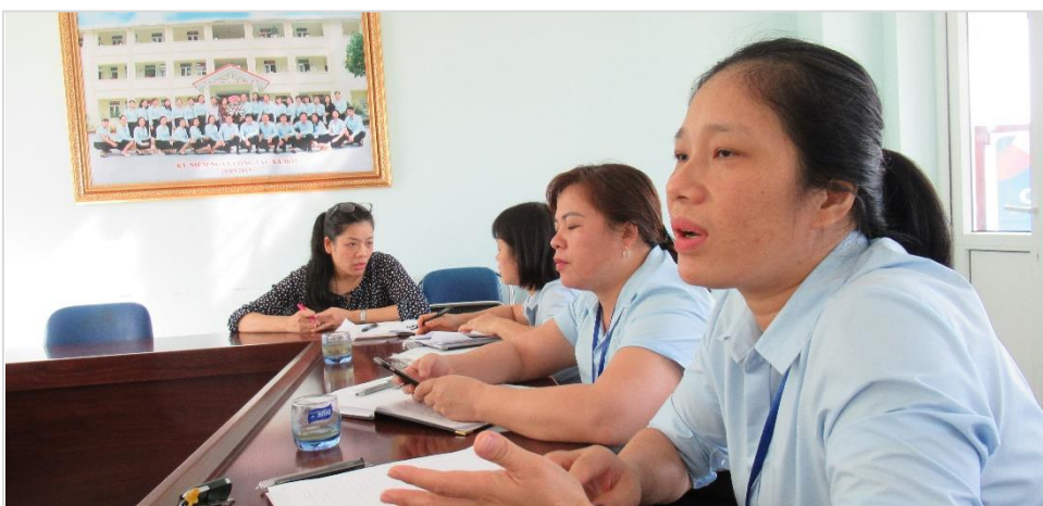
Evaluation of implementation of Decree No.9 at Social work center