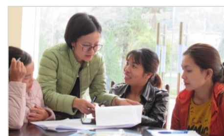
Questionnaire survey of survivor support Staff

97.6% of the 2,961 survivors who were received by LISA sector were female and 2.4% were male. 82.2% were over 18 years old and 17.8% were children under 18 years old. Among those received by LISA sector, 2,216 survivors (75%) received some supports from the government.