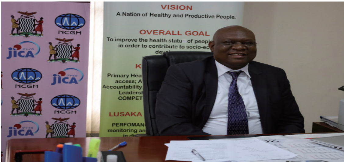
Interview with The Provincial Health Director ( Project's Manager)

The PHD has since appealed to JICA to consider infrastructure development of the University Teaching Hospitals particularly women and new born facilities as neonatal deaths continue to be the highest cause of death in these facilities and an upgrade of the In-patient facilities in all the 5 General hospitals in Lusaka District.