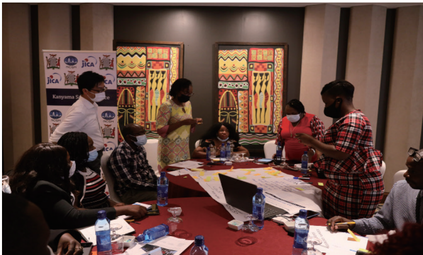
Kanyama General Hospital team working on a group task

The Project for Strengthening Management Capacity of the First Level Hospitals in Lusaka District recently conducted a flagship workshop on Hospital Management for the five General Hospitals in Lusaka. The workshop was attended by hospital management with observers from JICA's short term expats and staff, LPHO and LDHO.