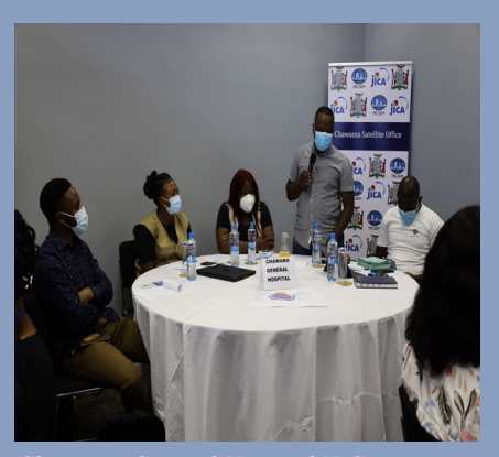
Chawama General Hospital IPC team at the recently held IPC workshop at the hotel Le Elementos in Lusaka