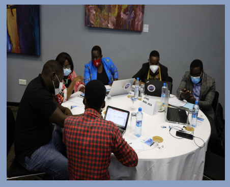
LPHO and LDHO team at the recently held IPC workshop at the hotel Le Elementos in Lusaka