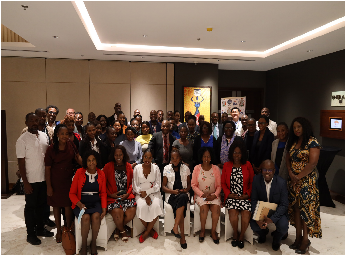
In picture : Inventory Management for Essential Medicines and Medical Supplies (EMMS) workshop delegation from the Five general hospitals, KiZ, ZAMMSA, UNDP, LDHO and LPHO

PROJECT CONDUCTS WORKSHOP FOR INVENTORY MANAGEMENT FOR EMMS FOR ALL FIVE HOSPITALS