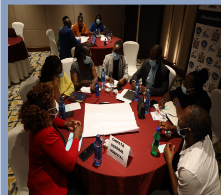
Chipata General Hospital team at the recently held EMMS workshop at the Sarovar Hotel in Lusaka

W hile the government of Zambia through the Ministry of Health is working tirelessly to ensure this issue is resolved, the Project for Strengthening Management Capacity of the First Level Hospitals in Lusaka District is complimenting those efforts through key stakeholder engagement. The key stakeholders engaged include patients, facility staff, United Nations Development Programme (UNDP), Zambia Medicines and Medical Supplies Agency (ZAMMSA) and Ministry of Health through the Provincial Health Office. The project recently conducted a survey in the target general hospitals to get an idea of what is on the ground when it came to essential medicines and stock management. The results indicated that there was a deficit in the availability of essential medicines, a gap in inventory management, space management and coordination between the facilities and ZAMMSA. Additionally, the project discovered that the stock inventory system is manually managed and this process could cause challenges in the system like the turnaround time per client attended to, inefficient record keeping and demands more manpower. It is against this background that a workshop to engage stakeholders on what possible solutions could be for the current issues being experienced in these facilities. The workshop was held in Lusaka at the Sarovar hotel and in attendance was Kaizen Institute of Zambia (KiZ), UNDP, ZAMMSA, LPHO, LDHO, JICA