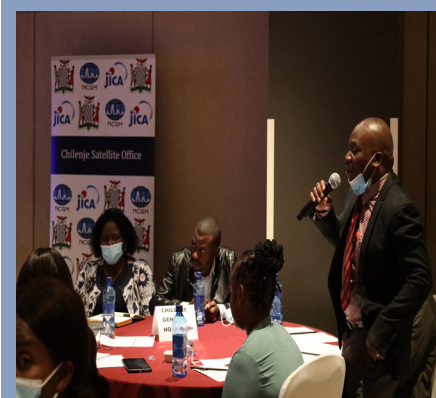
Chilenje General Hospital team at the workshop