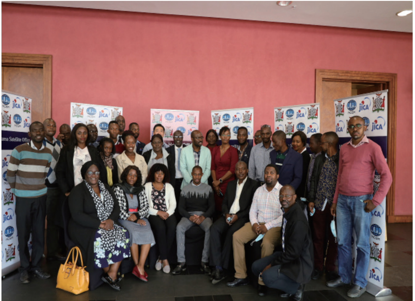
Medical Equipment Management Workshop participants from the 5 target hospitals, LPHO and LDHO on 4th May 2022 at Pamodzi Lusaka Hotel