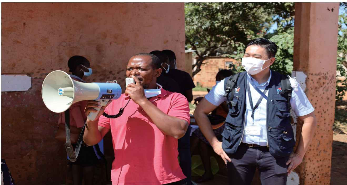
A community volunteer calls people to come to the vaccination site to receive their Covid-19 vaccination at Linda Grounds while Dr. Norizuki looks on

The Ministry of Health through the acting Health Minister Hon. Charles Milupi thanked the various supporting partners for coming on board with different resources in making the campaign possible. The acting minister said that for Lusaka Province, out of the eligible population of 1,924,856, Lusaka Province had vaccinated 646,154 by 31st May 2022 depicting a Coverage of 33.6% total vaccinated. The acting minister also thanked the health workers for their diligence. The campaign was further extended to 30th May, 2022.