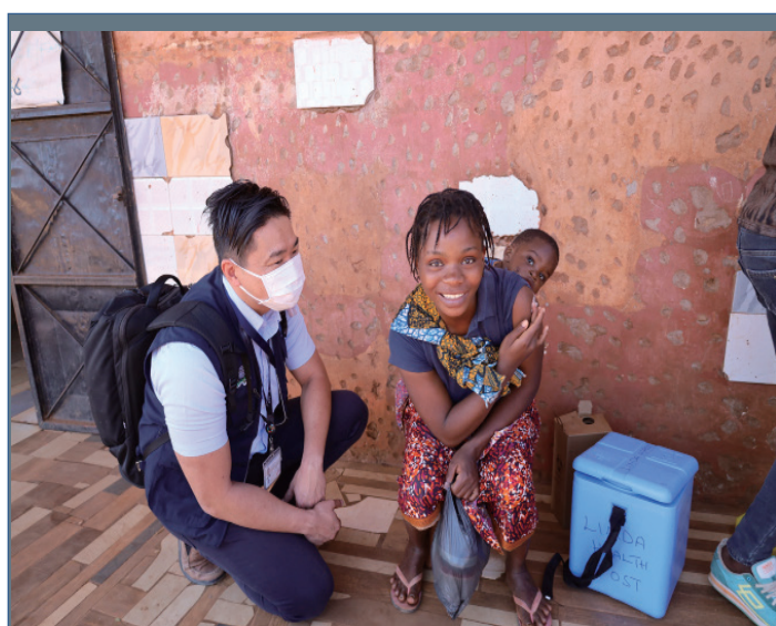
Young Mother happy after getting vaccinated at Linda Grounds in Lusaka