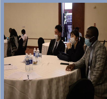
Health Sector team from JICA Zambia at the workshop