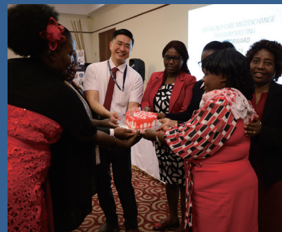
Presentation of cake as a form of gratitude to the Matrons of the 5 general hospitals for their dedication towards the work they do