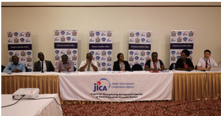
Plenary session at the emergency care management/ exchange program for frontline health care workers in Lusaka Levy Mwanawasa, Chipata, Chilenje,

To strengthen the knowledge and skills transfer in emergency and critical care management among front-line healthcare workers at different levels of care