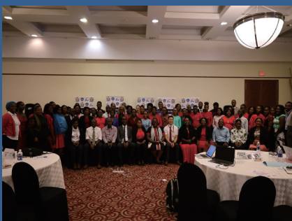
Participants pose for a group photo at the emergency care management/ exchange program for frontline health care workers