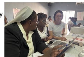
Development of action plan