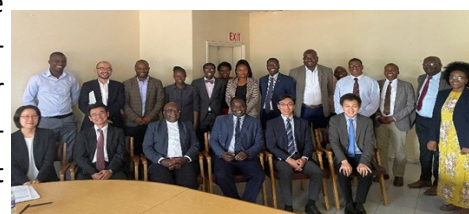
Participants of JCC

QAPS Directorate and the Chief Advisor of the Project presented the progress of activities and the activity plan. Resolutions were made during this meeting to address the identified challenges and were duly endorsed by the participants. In addition, the necessity of promoting 5S-KAIZEN-TQM activities was reaffirmed among the participants, and the directors of the participating hospitals expressed their commitment to enhancing activities at each hospital.