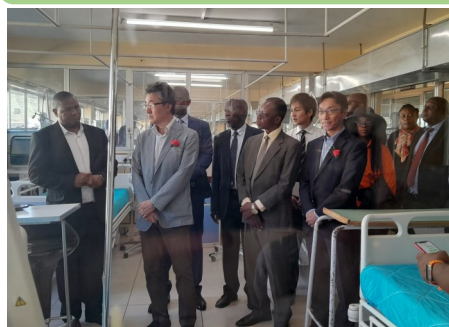
Media tour at Gweru Provincial Hospital

On March 27th, 2024, the Deputy Minister of Health and Child Care Hon. Mr. Grant Aid as well as the achievements of Kwidini, the H.E. Mr. Yamanaka, the Ambassador of Japan, and Mr. Furuta, the Resident Representative of JICA Zimbabwe office visited Gweru Provincial Hospital to host a media tour of the hospital covering the status of utilizing medical equipment provided by the Japanese through 5S-KAIZEN-TQM approach. Visitors applauded the progress and achievements of QI activities at the hospital, encouraging the continuation of such efforts to achieve even greater results.