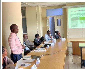
Presentation of the progress of activities

On March 1, 2024, the 2nd JCC meeting was held at MOHCC. In attendance were the Acting Chief Director of Preventive from MOHCC, representing the Permanent Secretary, along with 10 hospital directors, 1 representative from the Embassy of Japan in Zimbabwe, 3 members from the JICA Zimbabwe Office, and 7 members of the Project. During the meeting, the Quality Officer of