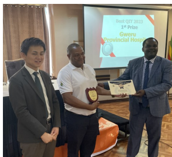
Awarding ceremony (Best QIT)

Buoyed by the rewards, the meeting closed on a high note with participants having learned from each other and motivated to further the quality improvement activities under their influence.