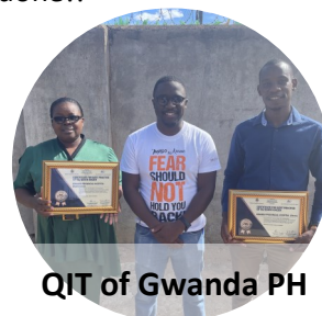
QIT of Gwanda PH

The store room in Gwanda Provincial Hospital has resulted in improved work efficiency, effective stock management, cost reduction, and enhanced safety for staff through these Quick KAIZEN / 5S activities . Well done!!