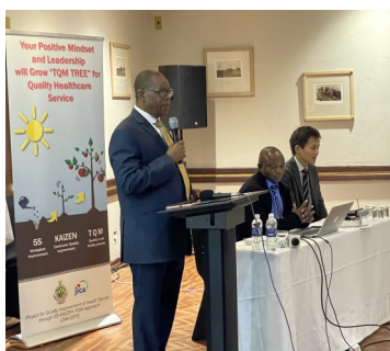
Opening remarks by the honorable Minister