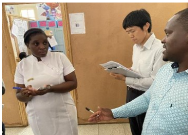
M&E implementation in Gwanda Provincial Hospital

From September to October 2023, the 1st external M&E was conducted at every target hospital to confirm the progress of QI activities through 5S-KAIZEN-TQM approach. The M&E was implemented by the Project in collaboration with Provincial Health Executives (PHEs).