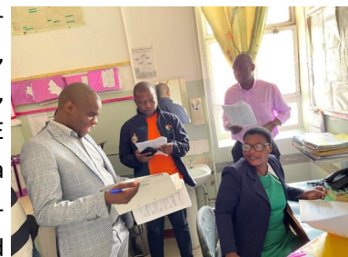
M&E exercise at VCPH

During the training, participants engaged in lectures, practices, and discussions, alongside a hands-on M&E exercise at Victoria Chitepo Provincial Hospital. They followed required