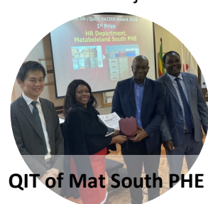
QIT of Mat South PHE

The HR department of the Mat South PMD office has resulted in improved productivity and enhanced staff safety through 5S activities, especially the SORT-SET-SHINE activities. Good job !