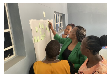
Group work on stakeholder analysis

At the end of the training, feedback was also provided on the annual reports submitted by each hospital in January-February this year. Each hospital was then asked to prepare a draft activity plan for the current year. The draft plan submission deadline was agreed for April 2024.