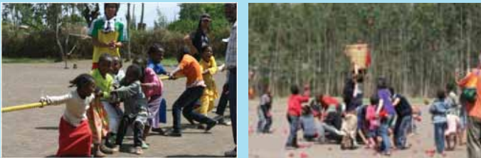
The tug-of-war (left) and 'Tama-ire' (right). Children and adults truly enjoyed the weekend Undokai.

All the programmes were successfully completed and the red team beat the white team in the total score. Pupils, teachers and community had a good time together and everyone went home with a big smile on his/her face.