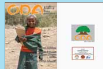
The second issue of ODA magazine was published in February 2011.

and the copies were delivered from ZEO to WEO/STEO, CRC and primary schools eventually.