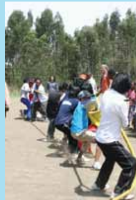
The tug-of-war between Ethiopian vs. Japanese teams for national pride!

Undokai is the school event that not only pupils but also parents and community can enjoy thoroughly. It is also the fascinating school activity that plays a catalytic role as the whole process of Undokai - from planning, preparation to implementation includes all the essences of school improvement. It will help school director to strengthen his/her planning and management capacity: teachers will develop good teamwork and communication: pupils not only have fun but also learn how to act and cooperate in a group activity: community gets to know more about what school is doing and of course it really helps to develop partnership between school and community. If your school is interested to organise Undokai, please contact Ho! ManaBU. We are very happy to cooperate with your school and community. Let's enjoy Undokai!