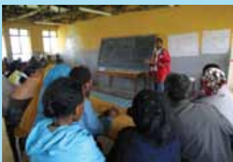
The participants learn the school environment at the quiz-style Training 'Discover our school'.

DOS is the Training which facilitates school staff to get more aware of the school environment by researching their school (Part 1), to share their findings and analysis with