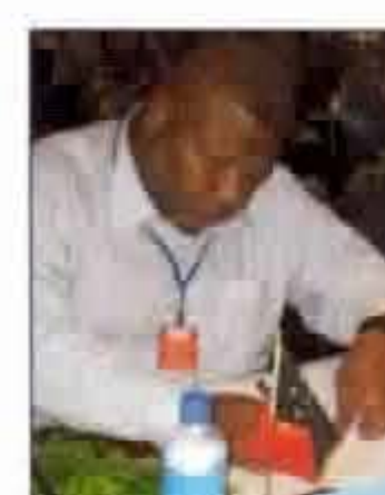
Hon. Patrick Tammur Minister Ministry of Communication and Information Papua New Guinea