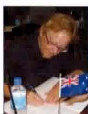
HE Christine Bogle High Commissioner to Tonga New Zealand