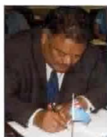
Hon. Taukelina Finikaso Minister Ministry of Communication, Transport and Tourism Tuvalu