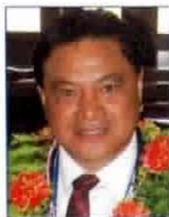
Hon. Apii Piho Minister Ministry of Justice, Health, Internal Affairs, Youth and Sports, Non Government Organisations Cook Islands