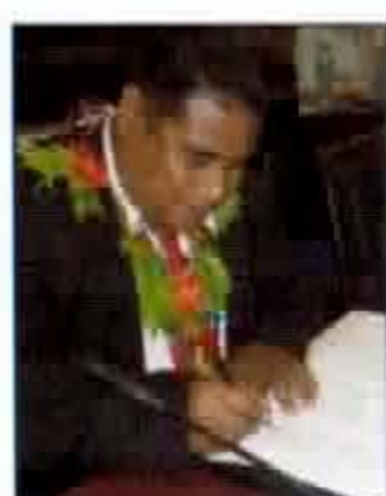
Hon. Temate Kateitenang Minister Ministry of Communications, Transport and Tourism Development Kiribati