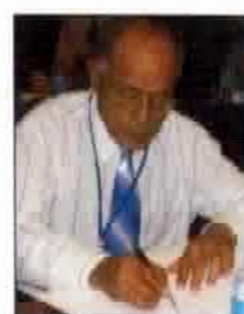
Hon. Pokotoa Sipeli Minister Ministry of Post and Telecommunications Niue