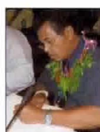
Hon. Jackson R. Ngiraingas Minister Ministry of Public Infrastructure, Industries and Commerce Palau