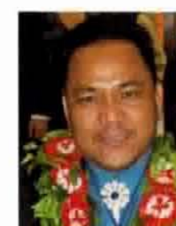
Hon. Kenneth Kedi Minister Ministry of Transportation and Communications Republic Of The Marshall Islands