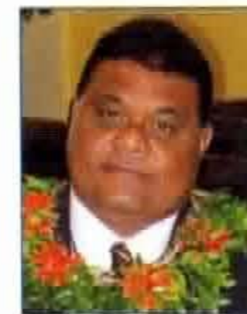
Hon. Francis Itimai Minister Department of Transportation, Communications and Infrastructure Federated States Of Micronesia