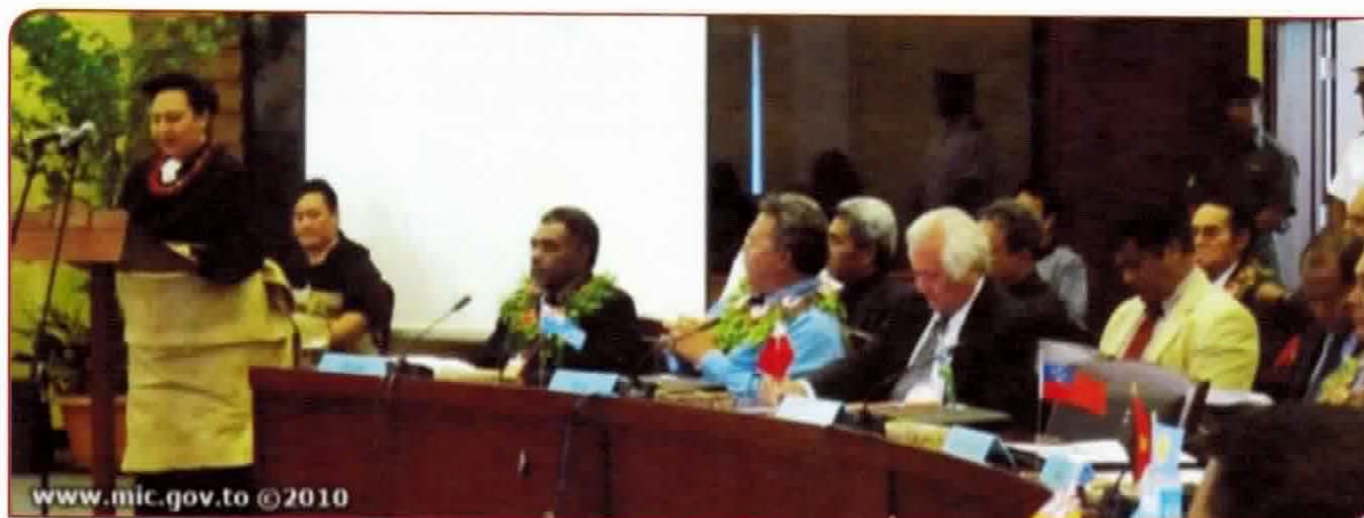
Her Royal Highness, Princess Salote Mafile'o Pilolevu Tuita, speaking at the Pacific Regional ICT Ministers' Meeting