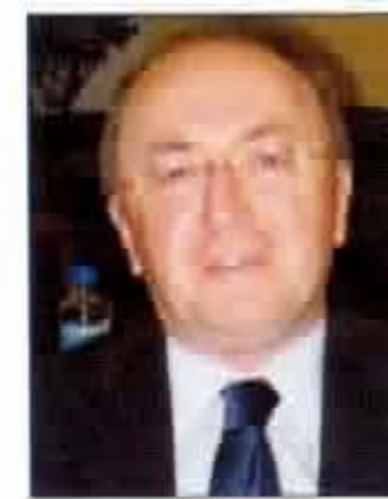
HE Bruce Hunt High Commissioner to Tonga Australia