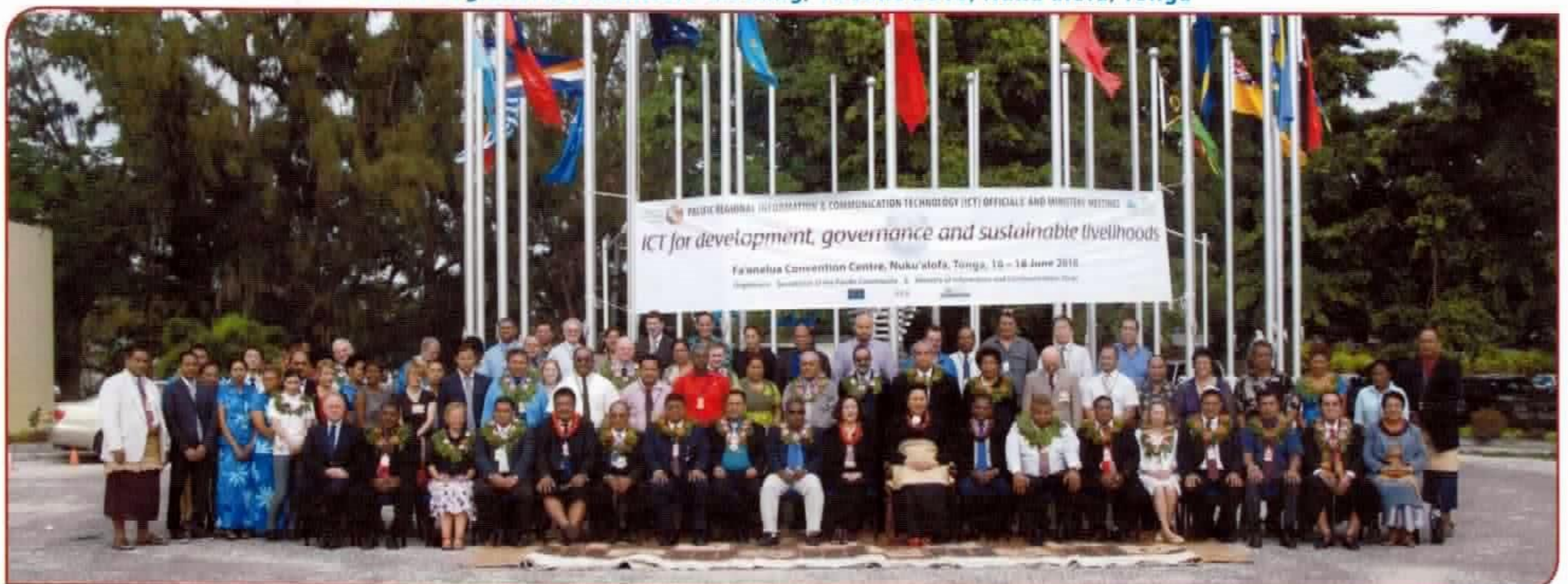
Pacific Regional ICT Ministers' Meeting, 18 June 2010, Nuku'alofa, Tonga

The e-talanoa newsletter will focus on ICT development in the Pacific, highlighting successful ICT projects, sharing relevant ICT news, and providing insights from various ICT partners and stakeholders on how ICT can address the challenges we face in the Pacific. This issue of the newsletter is dedicated to the two meetings in Tonga with a special focus on the outcome of ministerial meeting.