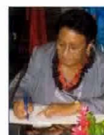
Hon. 'Eseta Fusitu'a Minister Ministry of Information and Communications Tonga