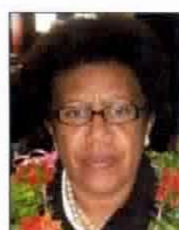
Taina Tagicakibau Permanent Secretary Ministry of Public Enterprises, Tourism and Communication Fiji