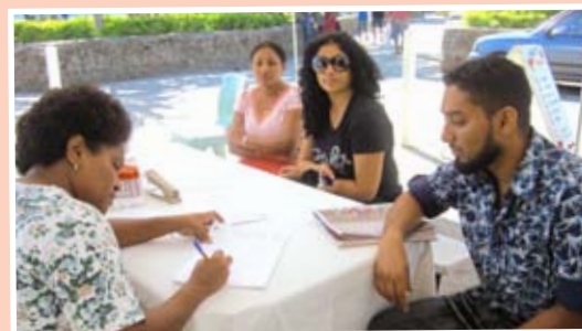
Donors register during the blood drive in Lautoka.

After successful blood drives at the University of the South Pacific's Lautoka Campus earlier in the year, a similar initiative was launched by the USP Lautoka Campus for the Western Division in Fiji.