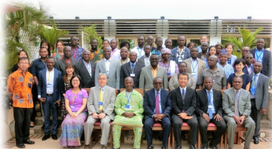
Group Photo at the launch of CHPS for Life at the Accra City Hotel in Accra Ghana

Later that day, the Joint Coordination Committee (JCC) meeting, which is the highest decision making body of the project was held. Two important milestones were achieved at the meeting; (1) The meeting discussed and approved the project work plan for the first term (July 2017 to June 2019). (2) It also approved proposed modifications to the Project Design Matrix. In addition, the progress of the project activities and upcoming events were shared.