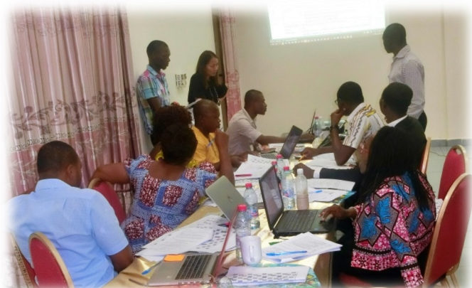
UWR group working on their work plan at the workshop

The workshop to develop the project workplan was organized on October 26 and 27, 2017 at UDS, Tamale campus. Participants included DHMTs and RHMTs of each region and JICA Ghana office. Points of discussion included introduction of the project, strategies and steps to be taken at each level. Detailed activities and target group of each output were also discussed and finalized.