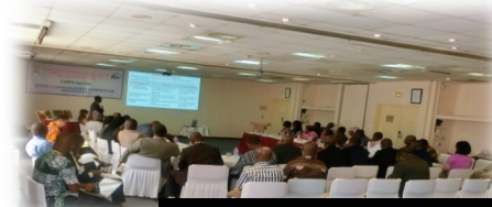
Joint Coordination Committee (JCC Meeting at Accra City Hotel in Accra)

A project like CHPS for Life is very important for us to take advantage of for the expansion of CHPS services to the entire family. If we can attend to the needs of everybody in the family, we certainly will be achieving universal health coverage (UHC). It is interesting that, the project is kicking off at a time the government has placed preventive care high on the national health agenda. This is the opportunity to synchronize maternal and child health with NTDs and the health of the aged. There is a plan to roll out wellness centers from 2018 where we will provide a comprehensive package of preventive services for everybody. Even before the CHPS for Life project enters the mid-year of implementation, we should be able to start sharing the best practices and