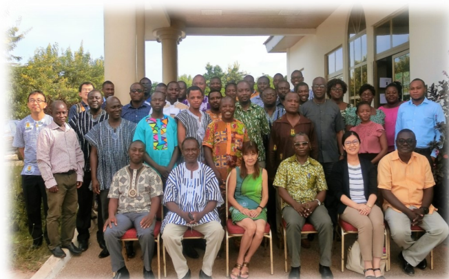
Group Photo of participants at the workshop