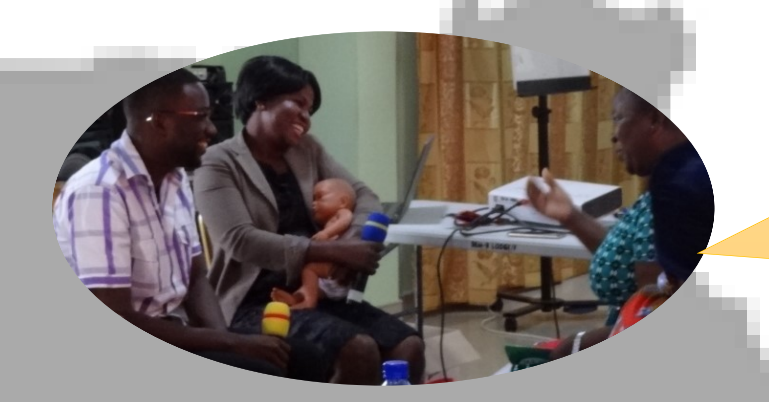
"Dear Mother" role-play to Introduce MCHRB in friendly and respectful manner