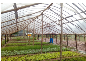
Last year's trial & errors finally turned into cash income!

Even under the suspension of many activities, the Project-supporting farmers were preparing for rainy season's production. Although the Project started preparation for supporting roofing cultivation since February, no one could visit sites under restriction in April. However, farmers themselves are currently setting up the wooden framework of roofing so that plastic sheets for roof will be distributed in May as scheduled. Cultivation area in this rainy season will be increased because the farmers have got regular customer last season which is a big encouragement to farmers for further production.