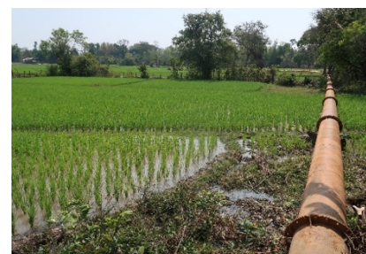
Nong Boua Luang, Xonnabouly Dist.

All those were done before the restriction under COVID-19 was announced at the end of March so that there were not much negative influences in irrigation and water management. As such actions were cooperated closely with rice and vegetable cultivation, irrigated areas in the Project sites have been expanded, such as 191ha (in 2019) increased to 260ha at Somsa-ad Site, 59ha (in 2019) to 100ha at Nong Boua Luang Site.