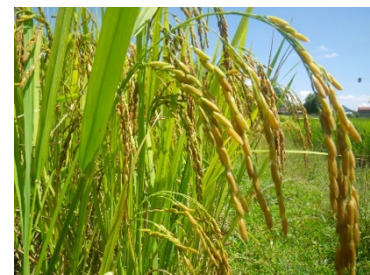
Expecting a good harvest