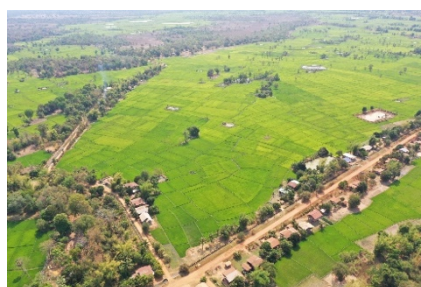
Somsa-ad, Xaibouly Dist.

With the supports from PAFO/DAFO staffs, Water Users' Groups have taken all necessary actions for water management, such as systematic water distribution plan, appropriate facility and water management.