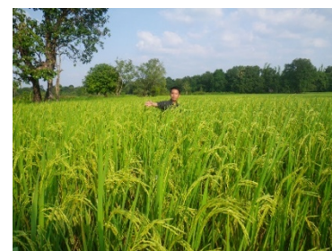
Rice growing constantly