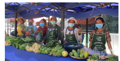
[Top] Dry season's veggie production using irrigated water (Xesalalong Site)