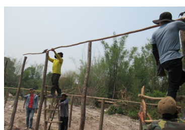
For starting roofing cultivation at new sites, training was also conducted by advanced farmers.