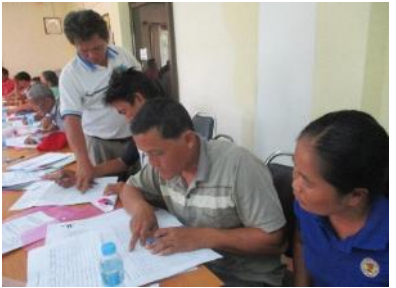
Strengthening farmers' group management