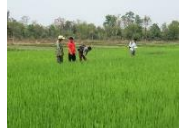
Patrol instruction in the field