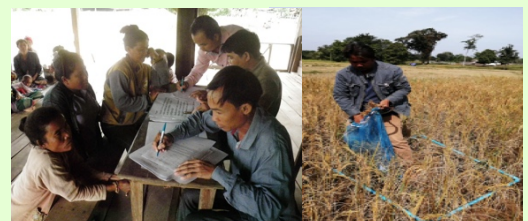
Both participants and yield increased