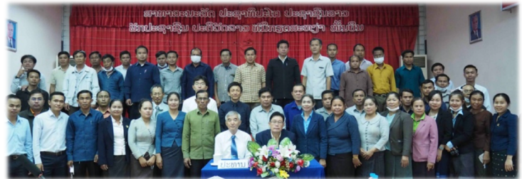
The 8th PMU Meeting

The summary of the results is shown as below.