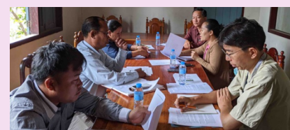
Hearing current status at Xonnabouly District