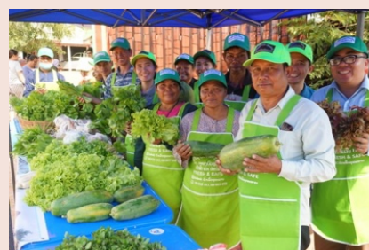
Several farmers' market opened