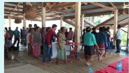
Election of WUG board member