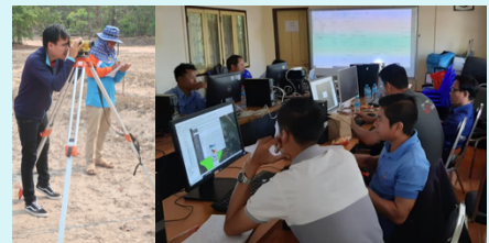
Technical trainings for district staffs