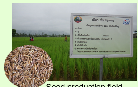
Seed production field