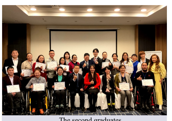
The second graduates

To resolve those challenges and raise awareness of private companies, DPUB2 organizes this training for 18 participants, mainly persons with disabilities. The participants are expected to become valuable human resources to raise awareness of private companies.