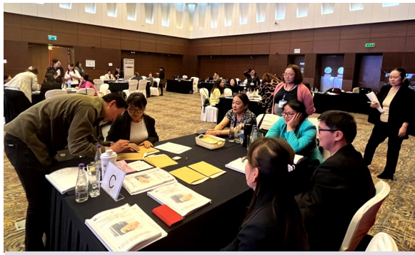
Participants in a practical exercise

The eight job coach trainers who supported the training have been trained through the technical support conducted by MLSP and DPUB2.