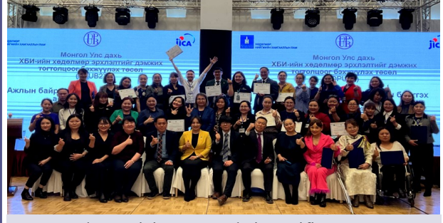
The participants got their certificates