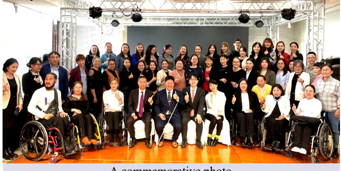
A commemorative photo

The seminar was organized in cooperation with the Human Resource Club (HR Club). DPUB2 will work together with them and promote more employment of persons with disabilities.