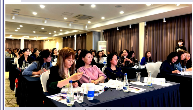
2. The Eighth awareness raising seminar for private companies conducted

DPUB2 organized the 8th awareness raising seminar for private companies on 19th April, 2023, and 28 persons from 25 companies participated. The lectures were trained persons with disabilities who have been involved in DPUB2. They successfully gave the presentation in collaboration with JICA experts from Mirairo Inc. Four job coach trainers and eighteen persons with disabilities who will be future lecturers observed the seminar.