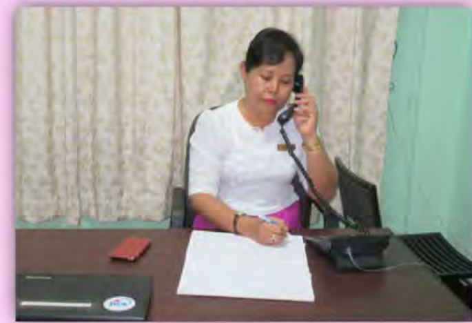
Coordination for providing vocational training for the victims