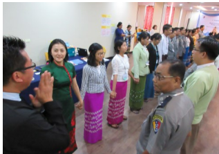
Participants of TOT