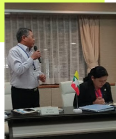
Training in Japan