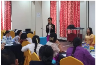
Lecture on TIP