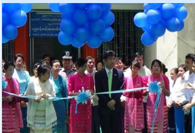
Information Center for Trafficked Persons (ICTP) Opening Ceremony in 2014

Based on the remarkable outcomes of the Phase 1 Project, the Phase 2 Project titled “ The Project on Capacity Development and Promotion of Networking on Assistance of Victims of Trafficking ” started in 2018 for three (3) years of project term.