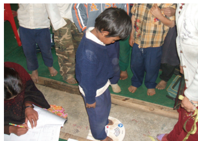
Physical Check-up: Measuring Weight