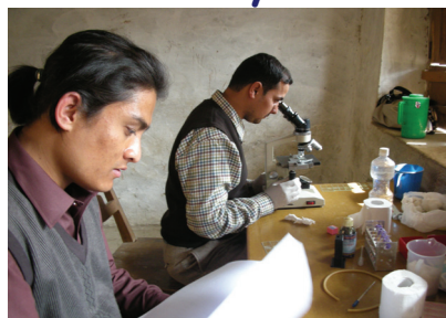
Conducted Blood and Stool Test