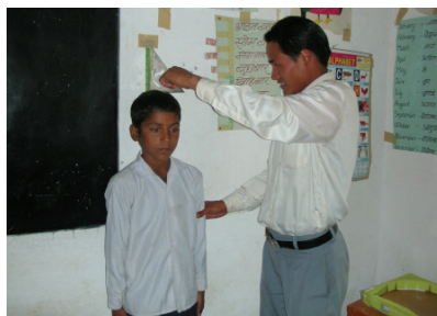
Physical Check-up: Measuring Height