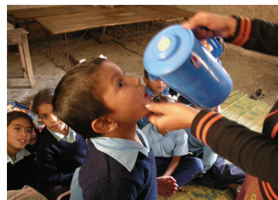
De-worming Tablet Distribution