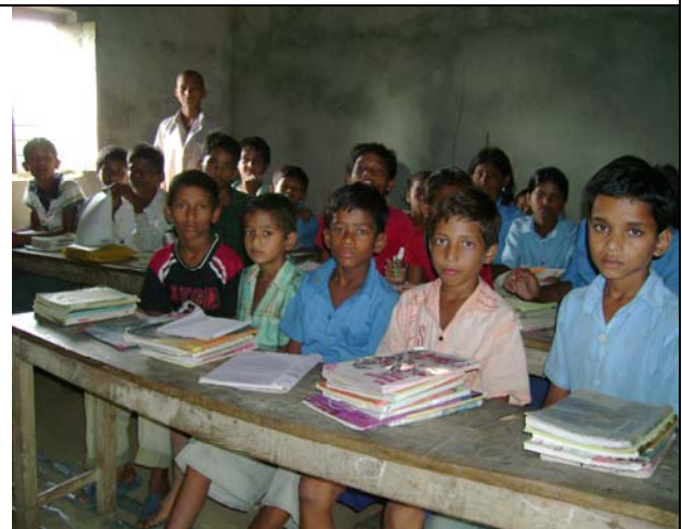
Children at Pipalchok Primary School