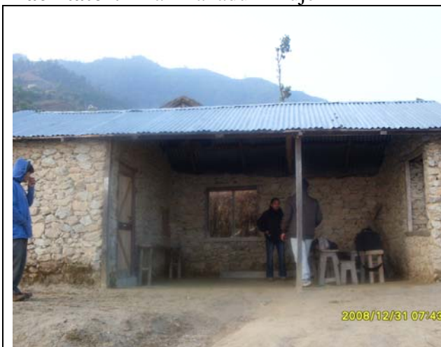
Center facility at Logaun