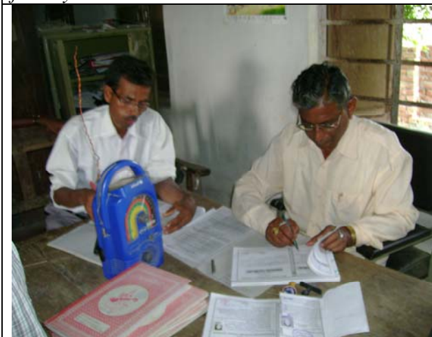
Head-teacher of Mother school completing the data during the field visit