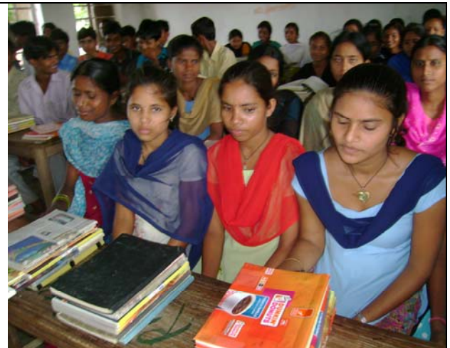
Girls studying in mother school.

The facilitator has gone abroad and nobody else has the record of the center at present. The CMC chair and head-teacher said that 32 children got enrolled in the center and 28 completed the center and 4 of them dropped out. Though they do not have the exact number, they said that most of the graduates are now studying in formal school but they could not produce any official record of their status.