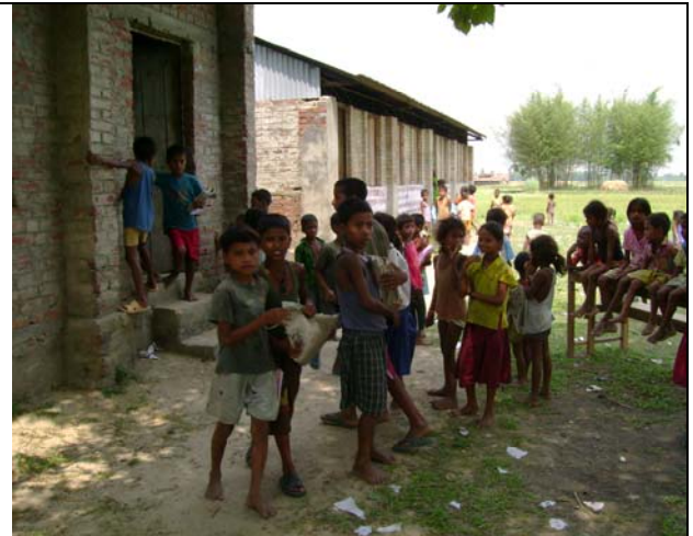
Mother school and the children playing during the break.

Altogether 24 children were enrolled in the center and all of them regularly attended the classes. According to the facilitator, only two of them did not attend the formal school after they completed the cycle. Nobody could tell the researcher where these two children went. Interestingly, in this place also the distance between the school and the center is just 5 minutes.