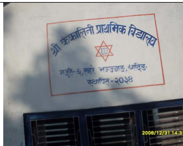
Mother School: Kankalini Primary School

This center is located in a remote part of Gajuri VDC and the population in this area is mostly janajati with Tamang in the majority. In this center 23 children were enrolled and 22 of them completed level one and 1 child dropped out. 21 children completed level 2 and 20 of them completed level 3. Those who dropped out were of 10 years old and they left education as they felt themselves over age to attend the school with small children. Among the 20 graduates, 2 of them enrolled in grade one, 9 of them enrolled in grade two and only 9 of them joined formal school at grade four. The attendance record shows that the third year attendance is comparatively lower.