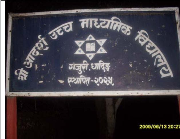
Mother School: Adarsha Higher Secondary School