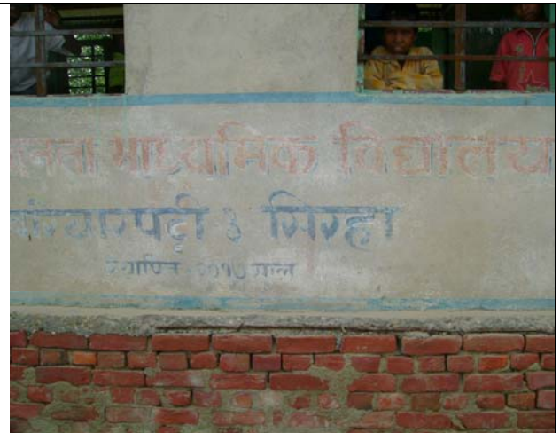
Mother School: Shree Janata Secondary School