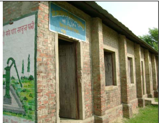
Mother School: Shree Primary School, Tenuwapatti

The facilitator said that in the beginning 28 children were enrolled in the center but only 21 of them attended the class regularly. Thus, there was a record of these 21 children only. All 21 children completed level 1 and 20 of them completed level 2 and 3 resulting all the 20 children completing the SOP cycle. She said that she does not have exact information about most of the children who completed the cycle. Mother school source said that only a few children came and joined the school in different grades but they also do not have the whereabouts of other children who completed their education at the center.