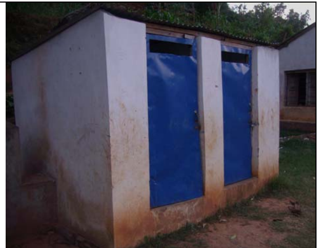
Toilet facility in the mother school.