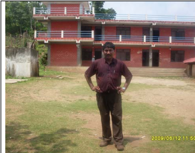
Mother school facilities