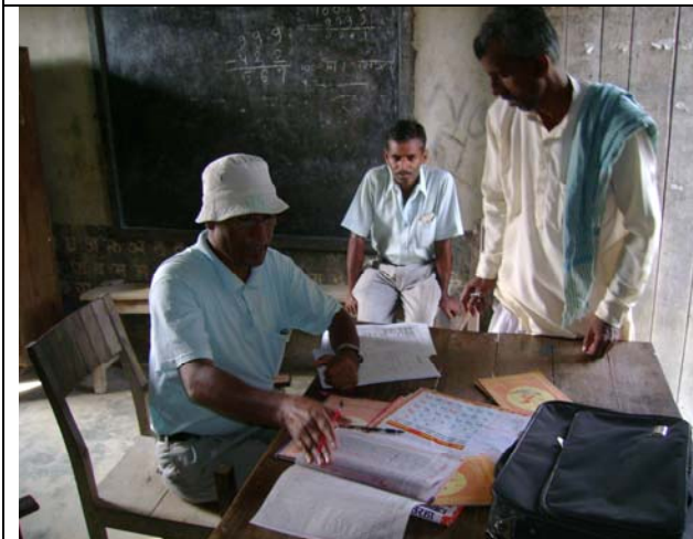
Head-teacher of Pipalchok Primary School talking to the Researcher