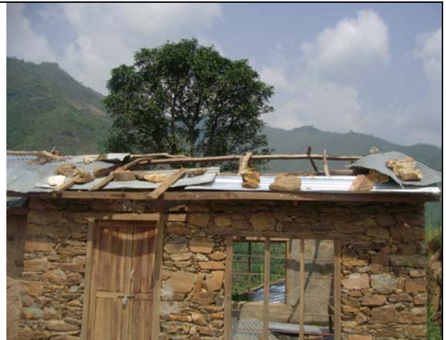
Primary school building under construction.