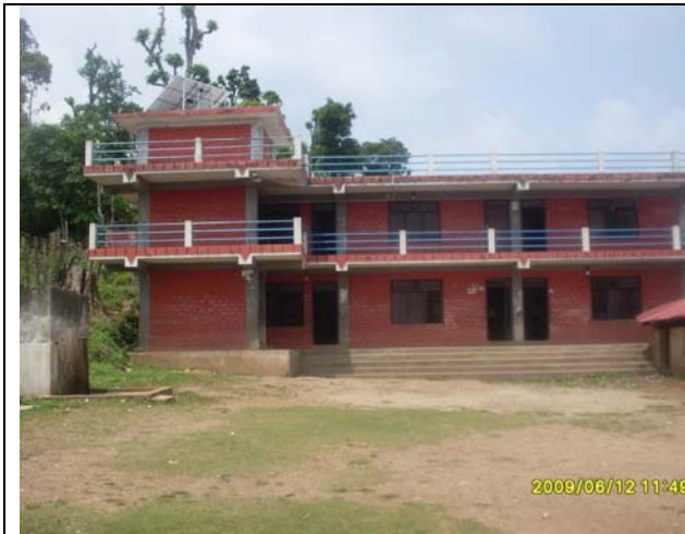
Mother School facilities