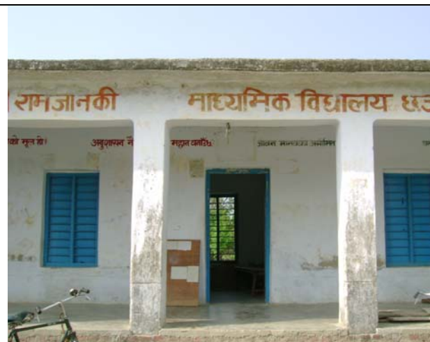
Mother School: Ram Janaki Secondary School

The enrolment register shows that 37 children were enrolled in the center. It was reported during the visit that some children left the center after attending it for a few days. As the stationery materials were given to only 20 children, other children left the center as they did not