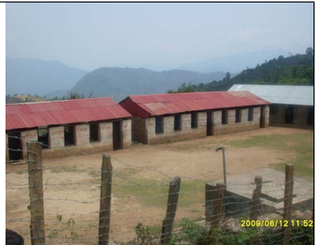
Panchakanya Secondary School