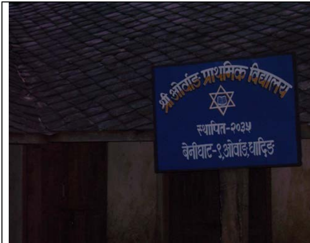
Mother School: Orbang Primary School.