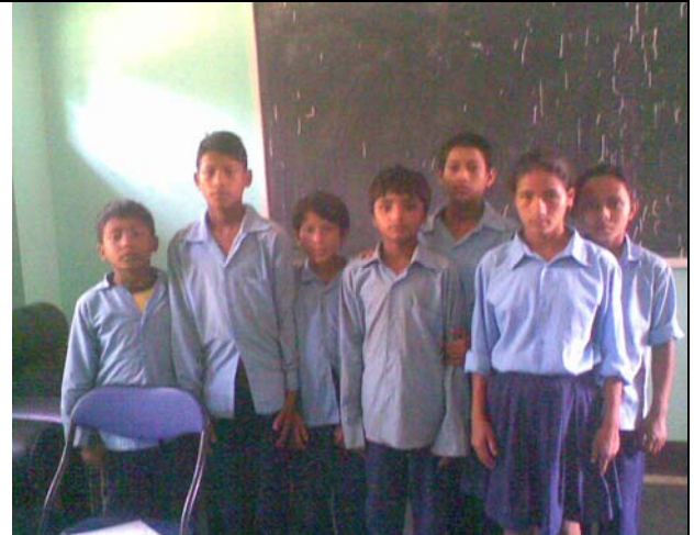
A student from this center went to Syadul and enrolled in grade six (third from the left)

This center is located in a community where dalit population is dominant and the people in this location are living a life of misery due to extreme poverty. Altogether 27 children were enrolled