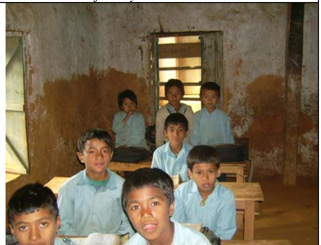
Children at Kalika Secondary School

This center enrolled 23 children and 20 of them completed the cycle and joined formal school in the desired grades. They studied there for a year and 12 of them were promoted to grade five and 8 of them have repeated the class this year.