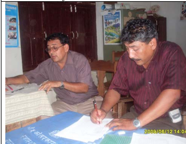
Researcher with the headteacher