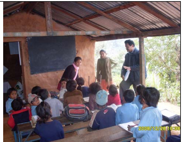
The FSP center where children are attending another Non-formal Education Program.