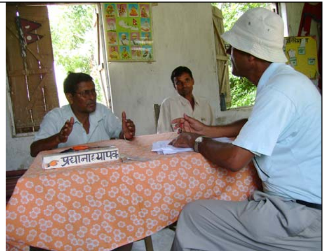
Head-teacher of Mother School talking to the Researcher.

This center is located in the school premises. The facilitator is the daughter of the head-teacher of the mother school. The enrolment record shows that altogether 32 children were enrolled in the center and according to the facilitator, all of them completed level 1. Out of 32 children in level 2, 28 completed the level and four of them dropped out. Two children died during the program. Altogether 21 children completed the cycle. Out of this number, 18 are now studying in grade five. The facilitator is now living in Kathmandu and the headteacher of the mother school said that the children who completed the cycle joined mother school only after two years. This is very interesting to hear that why all the children who completed the cycle waited for two years to join the mother school.