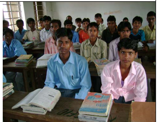
Children in mother school class.

The facilitator said that 21 children were enrolled in this center and all of them completed the cycle and they are now studying in the formal school.