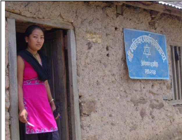
SOP Center: The center has now been converted into a primary school.