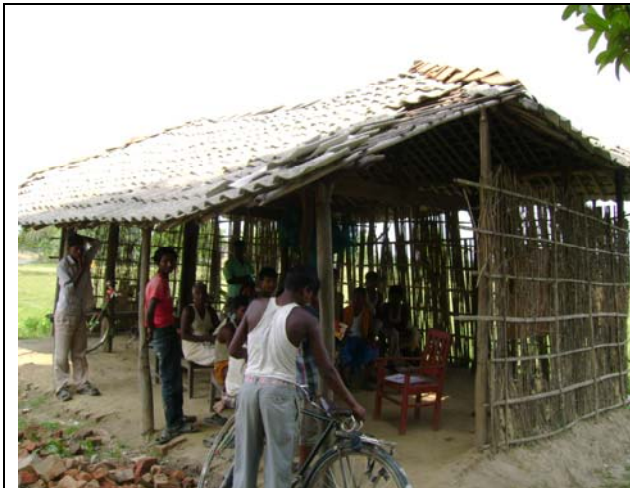
FSP Center: Kushaha Laxminiya VDC – 1, Baniniya