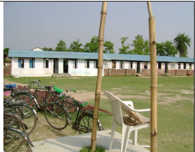
Mother School: Ram Janaki Secondary School