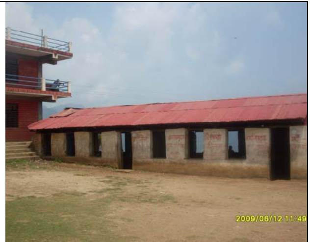
Mother school facilities

This center enrolled 30 children and 29 of them completed level 1, 25 completed level two and 22 of them completed the cycle. From the mother school record, six of them were found to have enrolled in grade six, seven enrolled in grade five and six enrolled in grade three. Three graduates did not join the formal school and the researcher could not locate the whereabouts of these children after they completed the FSP cycle.