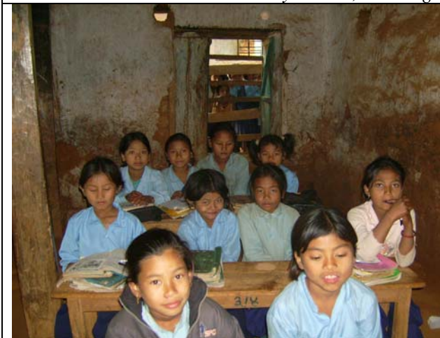
Mother school facility.