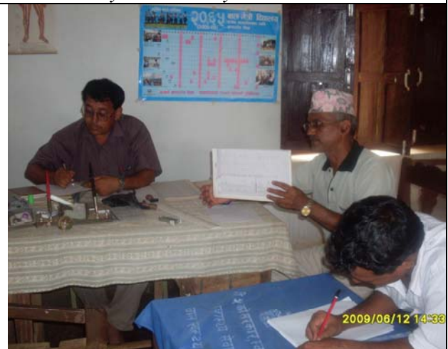
Staff room at the mother school

This center enrolled 25 children and all of them completed the SOP cycle. Out of this number five of them joined formal school in grade four, 16 enrolled in grade three and 3 of them enrolled in grade two. One child did not join the school. This school is a mother school of both FSP and SOP centers. The head-teacher of this school appreciated the CASP SOP very much and he further said that children from CASP ASP have outperformed other regular children in attendance, class participation and overall personality traits.