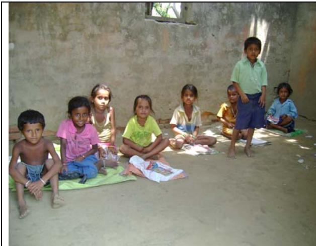
School classroom where the FSP class was conducted.