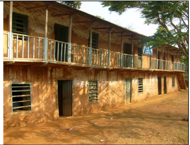
Mother School: Kalika Secondary School, Vidhang