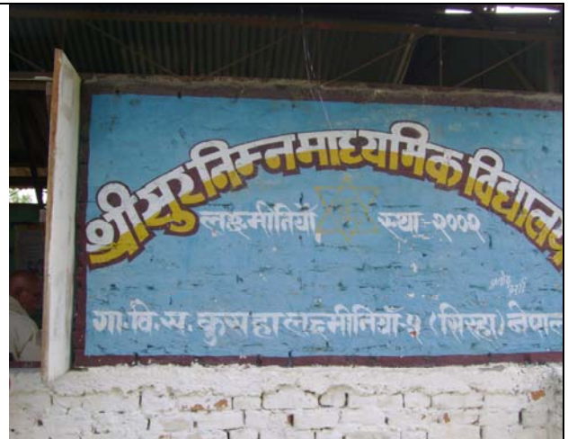
Sur Lower Secondary School: Mother School

The facilitator said that altogether 27 children were enrolled in this center and all of them completed the cycle. Of them seven children did not attend the formal school after they completed the cycle but other children are studying in different grades in the mother school. But the mother school record shows that only 10 of them are studying there.