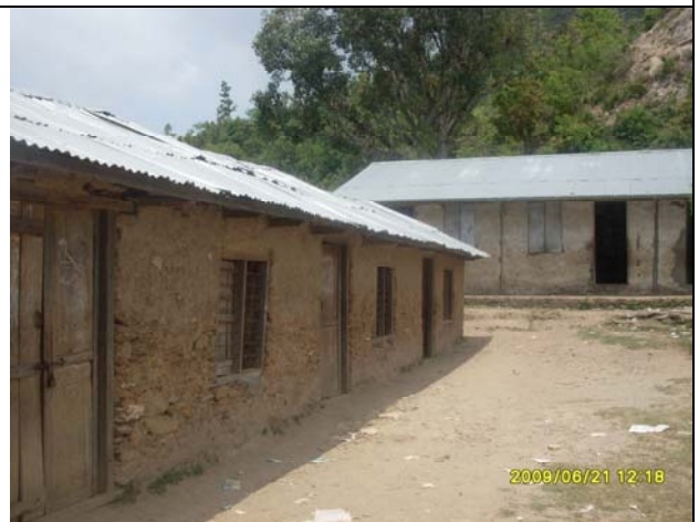
Goirang Lower Secondary school facility

This centre located in Jogimara – 5, has now been converted into Malika Primary School. Altogether 37 children were enrolled in this center and the list of the children was sent to CASP/JICA but the facilitator received the stationery and facilities only for 25 children and since then the rest 12 children's names were deleted from the register. Out of 25 children, all completed level one but nine children dropped out from level two and only 16 children graduated from the center and all of them joined grade four in Goirang lower secondary school. Those who dropped out went to the primary school in the later year and joined the lower grades in the school.