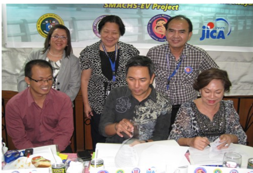
The Board Members during the signing of the first resolution made to promote maternal health in Eastern Visayas last November 10-11, 2011 in Tiara Oriental Hotel, Makati, Metro Manila.