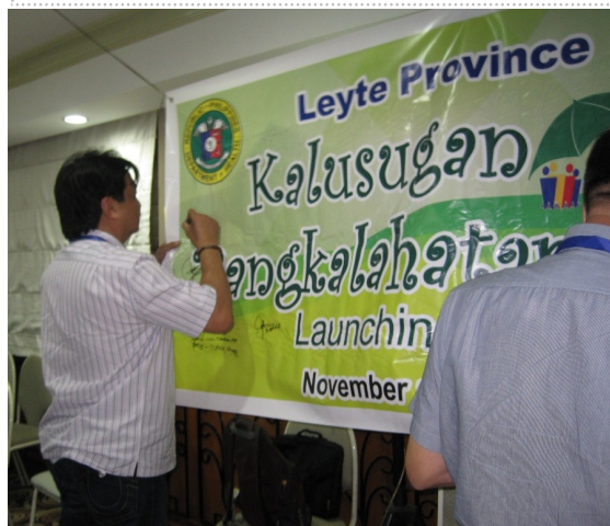
Mayors of Leyte are signing their names on the tarpaulin of the National KP strategy to signify their commitment during the 1st Joint ILHZ Board Meeting.