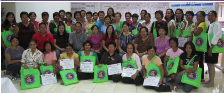
The graduates with their certificates and CHT home visiting bags during the commencement for CHT training.

On September 1, 2011, DOH-CHD8, PHO of Leyte and CHO of Ormoc successfully completed their Community Health Team (CHT) training with a total of 6 batches in Ormoc and 83 batches in Leyte. 3,159 trained volunteers are now deployed at community level, serving as a health navigator between communities and health facilities, particularly for the pregnant women, mothers and babies.