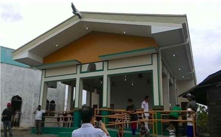
Brgy. Laak, Laak, Compostella Valley (November 23, 2015) and Brgy. Lukatan, Taragona, Davao Oriental (November 24, 2015)