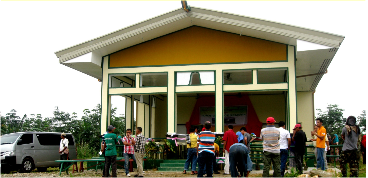
Multi-purpose Building awarded to community of Barangay Datu Tumanggong, Tungawan, Zamboanga Sibugay on October 23, 2015.

The Bangsamoro Transition Commission (BTC) Socio-Economic Office and Japan international Cooperation Agency (JICA) led the turn-over ceremony of two multipurpose buildings under the Quick Impact Project (QIP) in the Barangays of Pamintayan in Buug and Datu Tumanggong in Tungawan, Zamboanga Sibugay province on October 22 and 23, 2015, respectively.