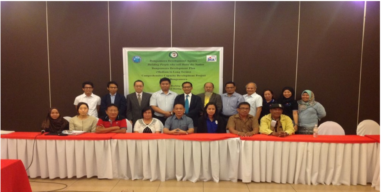
BDP in focus: A joyous countenance of the participants in the BDP 2 TWG Third Meeting, held at Microtel Hotel, Davao City on December 2, 2015.

respond the high expectations and needs of the Bangsamoro.