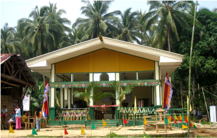
Brgy. Pamintayan, Buug, Zamboanga Sibugay (October 22) and Brgy. Datu Tumanggong, Tungawan, Zamboanga Sibugay (Oct. 23, 2015)