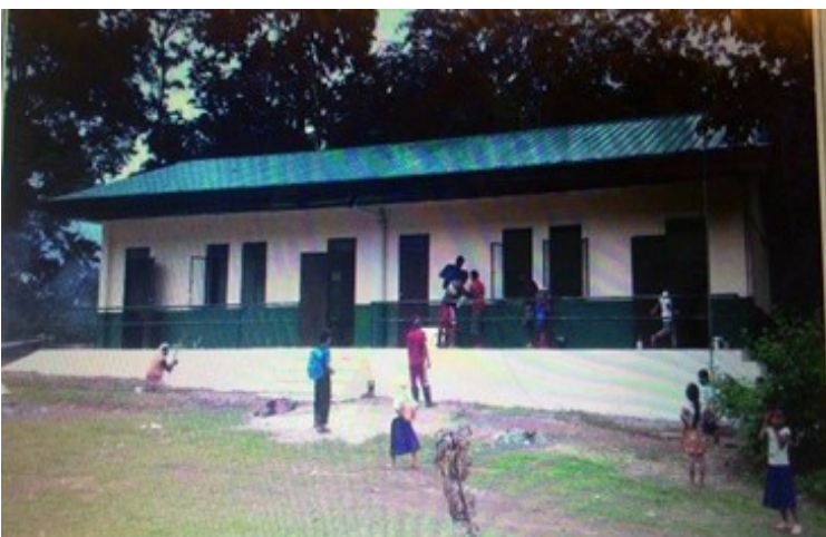
Brgy. Masola, Isabela City, Basilan (December 10, 2015)