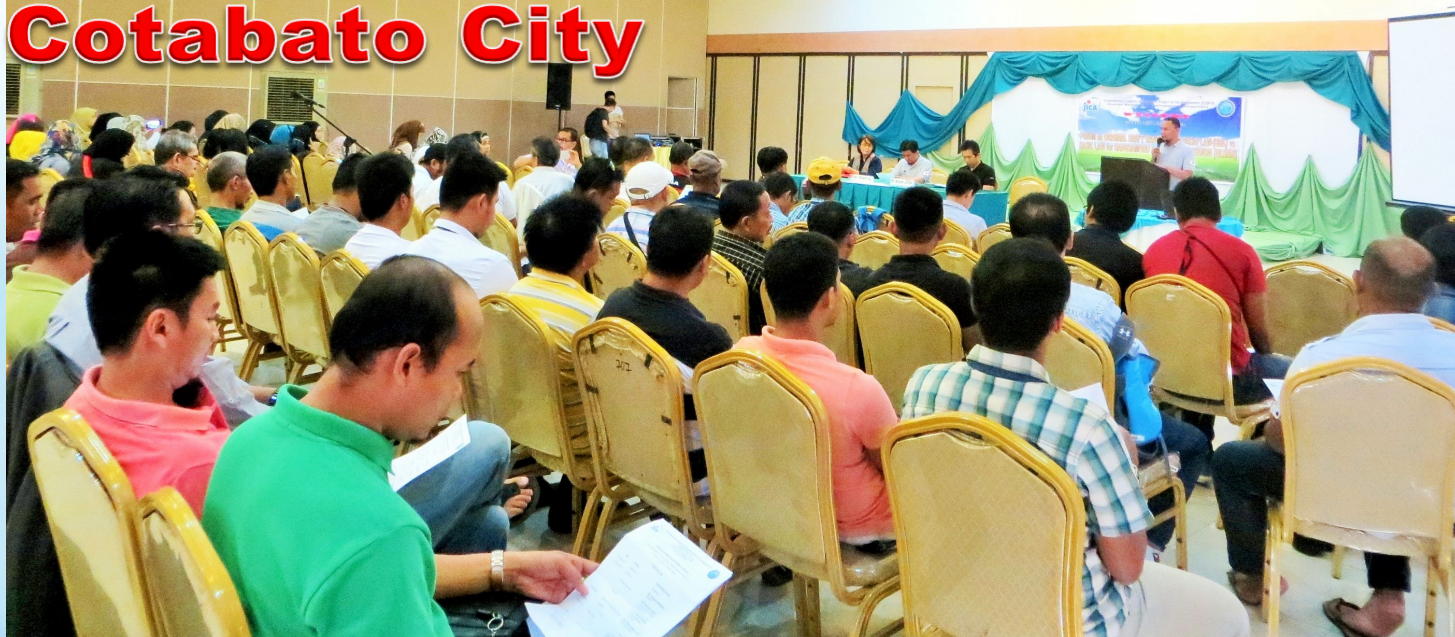
The participants from various organizations, academe, media and government agencies attended the BBL vs BLBAR Forum held at Al-nor Convention Center, Cotabato City on October 27, 2015.

A comprehensive forum and discussions on the original draft of Bangsamoro Basic Law (BBL) and the Basic Law for the Bangsamoro Autonomous Region (BLBAR) sponsored by JICA and BTC was conducted on October 27, 2015 under the Human Resource Development (HRD), a component of Comprehensive Capacity Development Project for the Bangsamoro (CCDP-B) at Al Nor Convention Center, Sinsuat Avenue, Cotabato City.