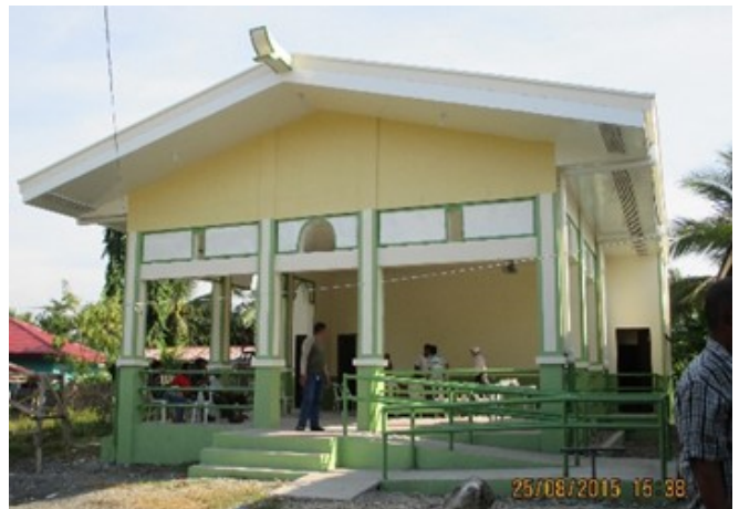
Brgy. Simsiman, Pigcawayan, North Cotabato (Dec. 2, 2015)