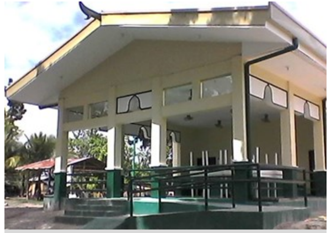
Brgy. Kibengi, Datu Saudi, Maguindanao (November 19, 2015)