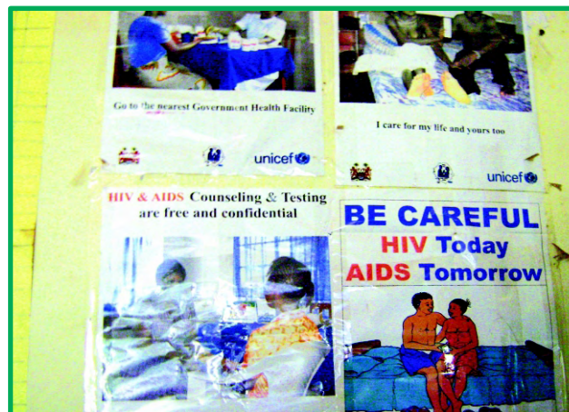
HIV/AIDS IEC Materials