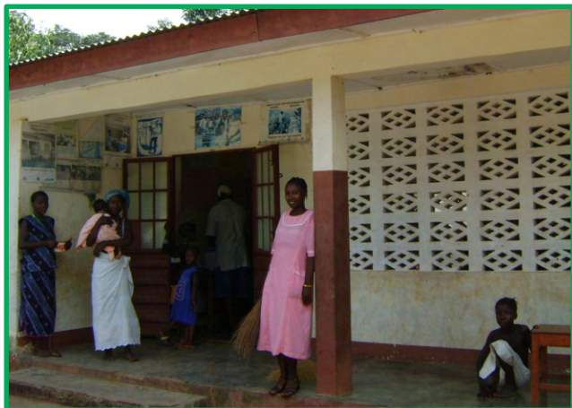
Rosinor Community Health Post

Rosinor is in Samu Chiefdom some 30 miles from the Government Hospital in Kambia and has a catchment population of 4239. It is a Community Health Post with one State Enrolled Community Health Nurse (SECHN) one Maternal and Child Health Aide (MCH Aide), Traditional Birth Attendant and a Volunteer.