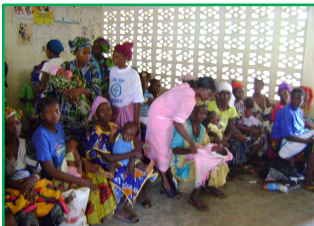
MCH Aide at work