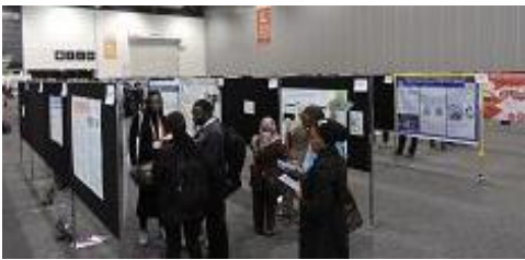
Poster sessions were held from 12hr30-14hr30 every day.