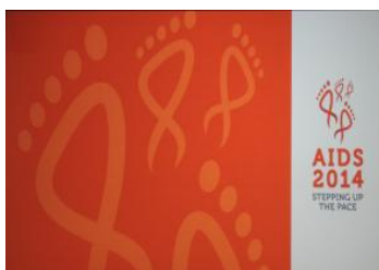
IAC logo was deisgned by Yohana Haule from Tanzania