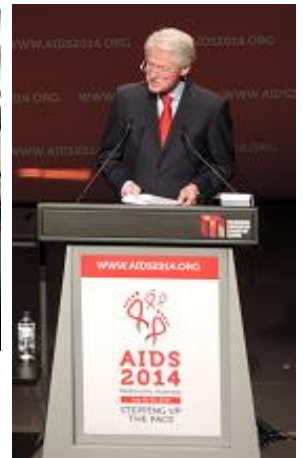
Bill Clinton, president of CHAI made a speech.