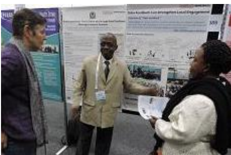
Team Mkuranga explained viewers of their activities.