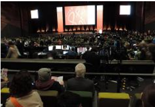
20 th IAC opened on 20 July, 2014.