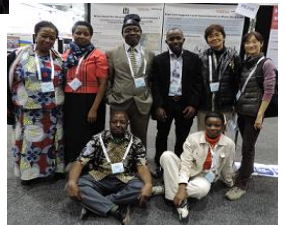
Participants from the project