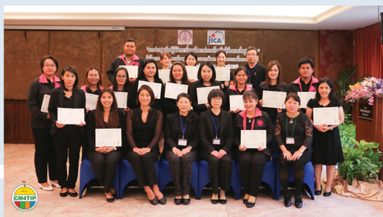
VCA Training Workshop, July 2017

JICA, on behalf of Japanese government, proudly assists the government’s effort by working together with Ministry of Social Development and Human Security (MSDHS), Division of Anti-Trafficking in Person (DATIP) through CM4TIP Project.