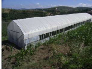
Sweet Corn, Sweet Potato, etc.