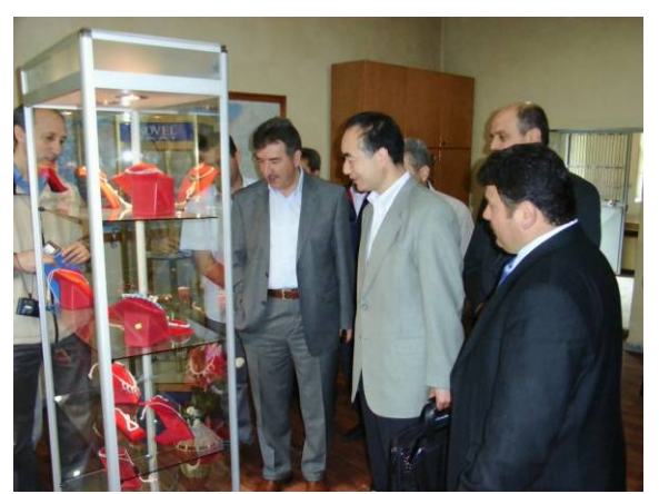
Display of local-made Kazaziye in Coşandere

This long-distance field visit could be a good opportunity for the guests for understanding of the Project. At the same time, it could encourage the local people concerning to the Project.