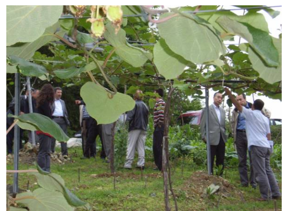
Inspection of Well-managed Kiwi Field in Uğurlu