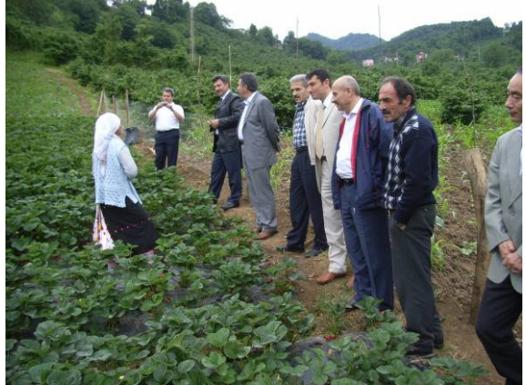
Observation of Woman-operating Strawberry Field in Kuruçam