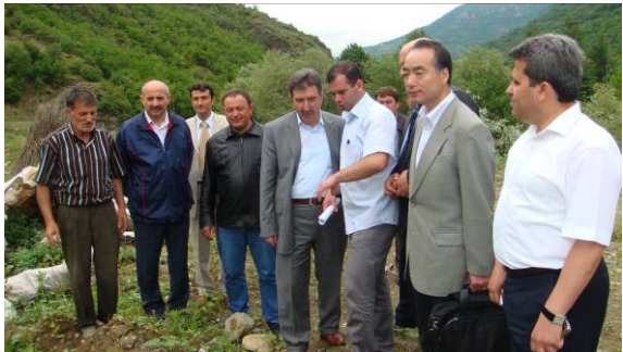
Explanation of Kiwi orchard by Regional Coordinator in Coşandere