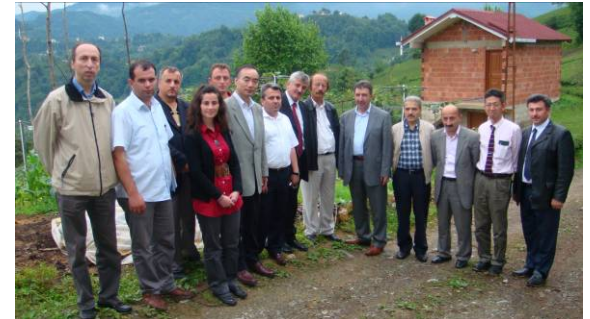
Completion of 300km-long tour for 3 model sites of the DOKAP-TARIM Project