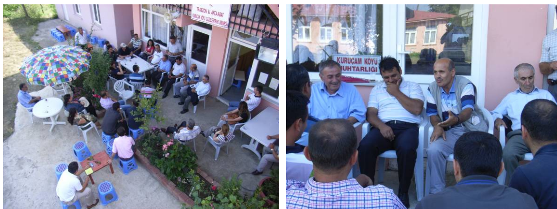
Discussions on Strawberry with Kuruçam Producers

The field visit was made to show recent activities and discuss with the leader farmers concerned to the Project. Main members of Kuruçam strawberry group explained their story of successful group works from training to marketing. Inspection of the greenhouses based on Japanese standard type was another destination of the field visit.