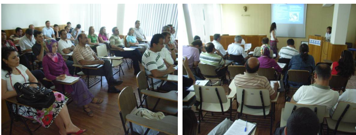
Classroom Lecture at the Project Office

The DOKAP-TARIM Seminar 3B (Planning course) was held for 25 agricultural engineers from the 6 provinces at the Project Office in Trabzon in 5 days from July 6 to 10, 2009. The main subject of the seminar was formulation of extension project plan. The participants summarized their rural survey in their provinces and compiled into project plan as a practice. Besides, the special subject on "Gender Consideration" was also main part of the seminar. For this subject, a TÜGEM staff was invited as a lecturer and the Provincial Coordinators attended. Furthermore, the field visit was made in Kuruçam (model area) and Darıca (extension area).