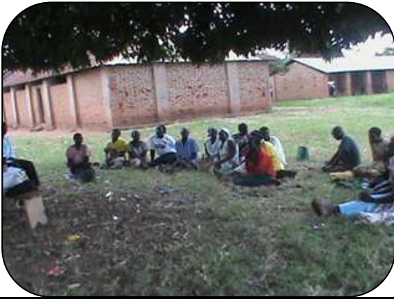
Work Plan Development in Omiya Anyima S/C

Sub-county CDOs participated and facilitated the process of implementation of the pilot project first phase [ 7 animal tractions and 1 heifer rearing]. The processing of CDD application forms, CDD group assessment and work plan development were done among others. A series of meetings also took place with the different communities/ groups implementing the pilot projects to develop work plan for the projects.