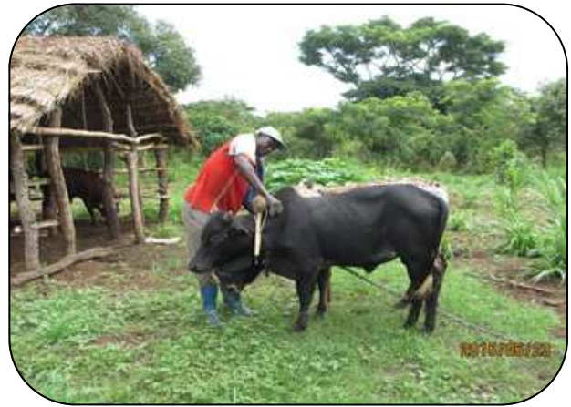
Shed constructed by group in Koch Goma S/C

The groups appreciate the idea of making shed because it would keep their animals healthy by providing good hygiene, protecting them from rain and sunshine. Traditionally in Acholi oxen are not kept under shed so this is a new idea the project has introduced and the groups have picked it up.