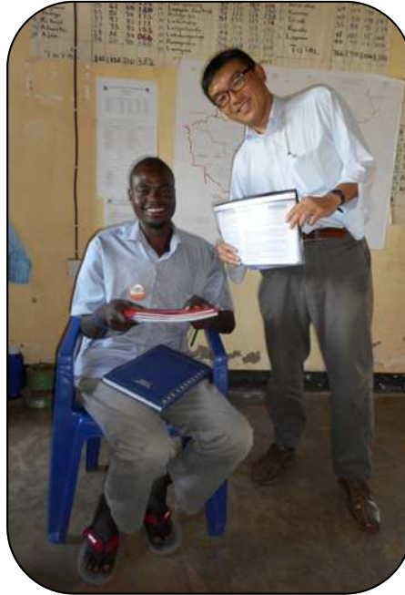
Together with CDO of Laguti S/C (Pader District) in September 2014