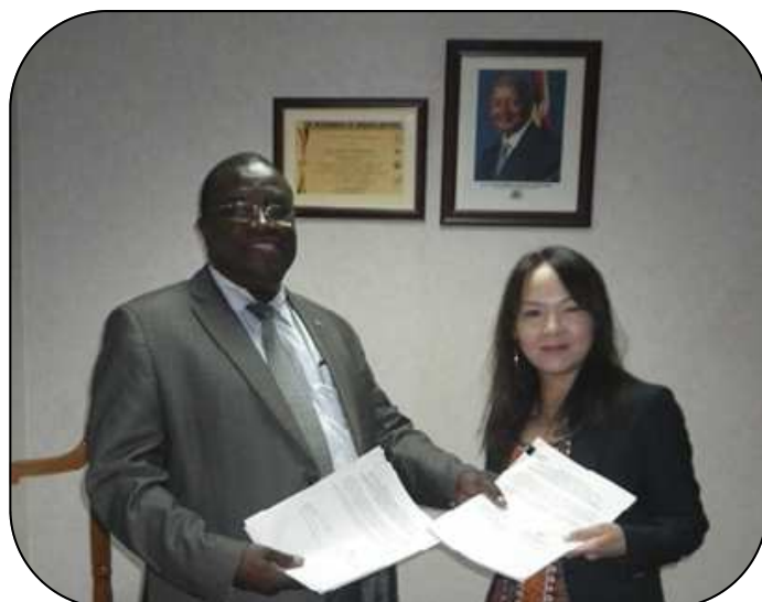
Presentation of Terminal Evaluation Report to PS of MoLG by Evaluation Team Leader