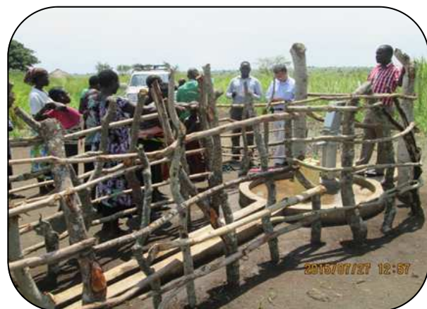
A Borehole Final Inspection in Nwoya District

In addressing water quality problems caused by corrosion, uPVC and Stainless steel pipes are installed instead of GI pipes in third round of pilot projects. For Boreholes with pump depth not exceeding 33m, uPVC pipes are installed. For boreholes with pump depths exceeding 33m, stainless steel pipes are installed.