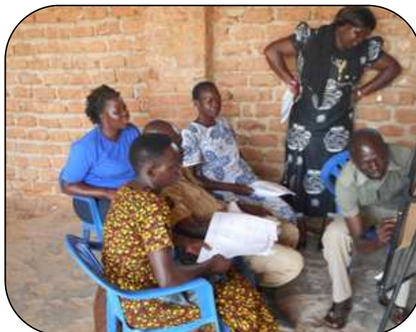
Unyama S/C in Gulu District