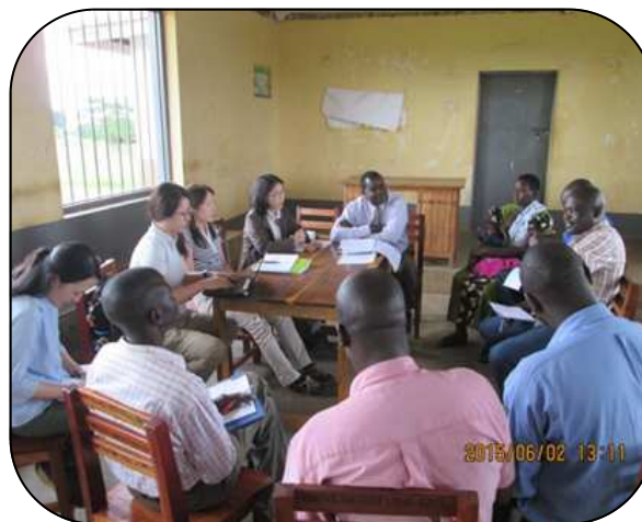
Interview to TPC members of Koch Goma S/C, Nwoya District

The evaluation team concluded that the Project purpose will be sufficiently achieved by the end of Project period (November 2015).