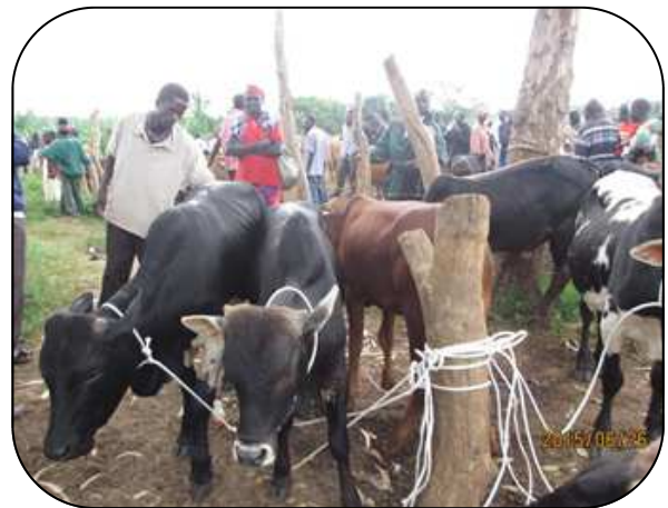
Procurement of oxen in Amach market, Lira

After the work plan development, both the group representatives and ACAP staff participated in the procurement of oxen and heifers in Amach market in Lira. In total 66 oxen together with 33 ox-ploughs and 8 heifers were bought for 12 groups. In addition 8 sprayers were also bought for 8 groups.