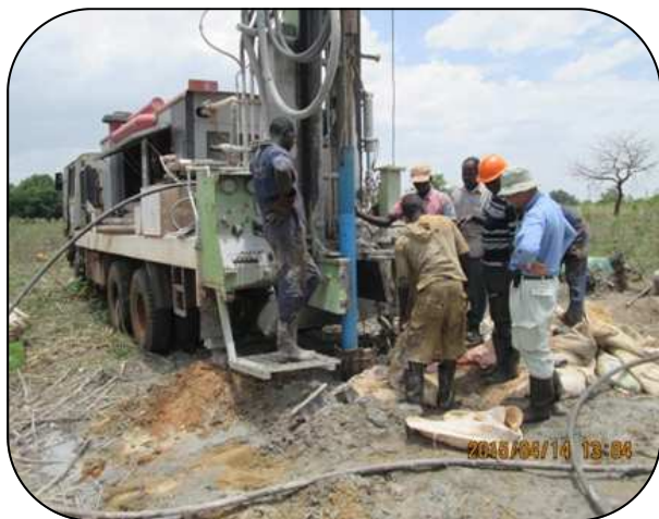
Borehole Drilling Supervision, Kitgum District

Nwoya and Pader Districts completed borehole drilling by end of July, 2015, while Amuru and Kitgum Districts completed in August, 2015.