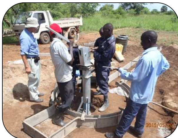
Hand Pump Installation in Amuru District