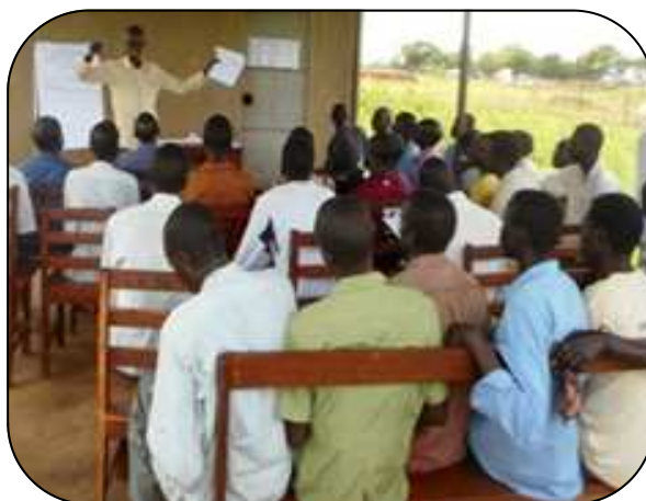
Wol S/C in Agago District