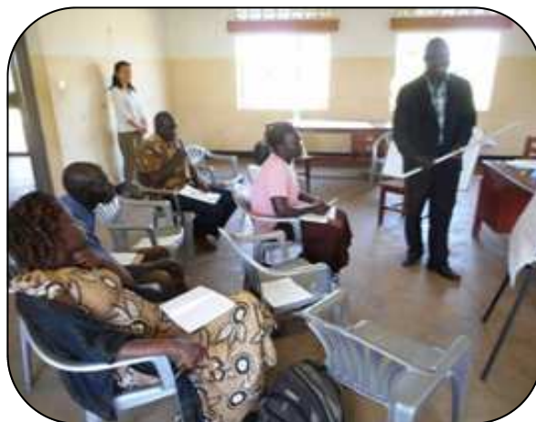
Padibe East S/C in Lamwo District