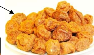
Sugared dry fruit