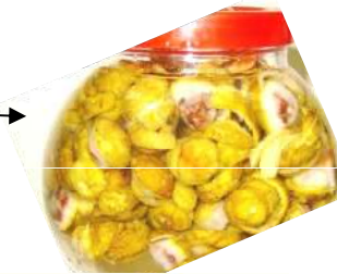
Embalm with sugar