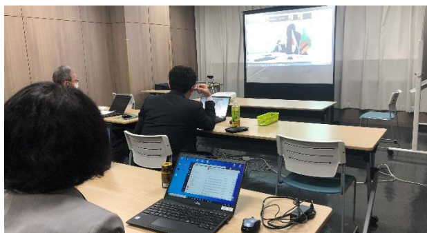
JCC meeting of Japan side. Japanese experts joined the meeting via online meeting system.