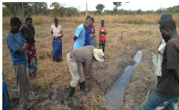
One of photos in the presentation by SIE. SIE in Luapula province explaining the water management method in the field.

Then, Japanese experts explained the revised implementation plan for the next year which was discussed in the National CPU meeting.