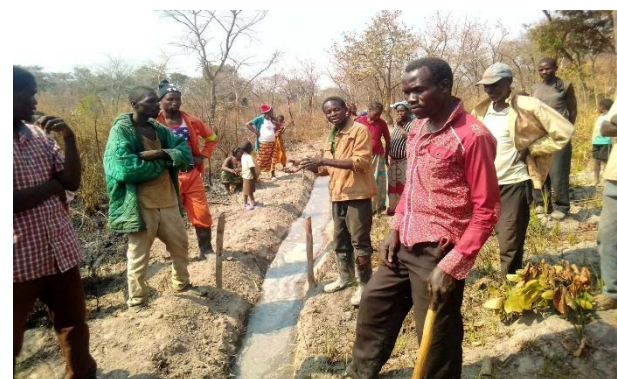
One of photos in the presentation by SIE. Farmers newly dug the irrigation canal following the instruction of CEO in Kasempa district in Northwestern Province.

Following the next year's plan, all participants held a general discussion. One of the participants shared the story that many development partners working with MoA are already adopting the COBSI approach. Regarding SHEP approach, one officer commented that it is better to make a linkage between farmers and schools or hotels as a potential buyer. One food and nutrition officer requested to carry out a nutrition survey in the new target province, and the project team agreed carry out the survey starting in 2021.