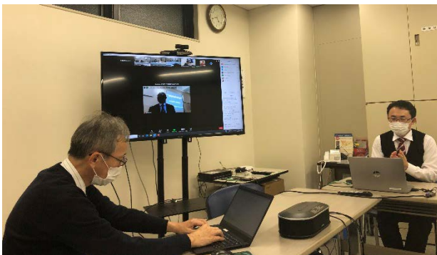
Japanese Experts participated in the meeting through online system and gave comments and questions to the participants in the meeting hall.

Japanese experts could not travel to Zambia due to the COVID-19 health restrictions but participated and presented towards the meeting through an online system.