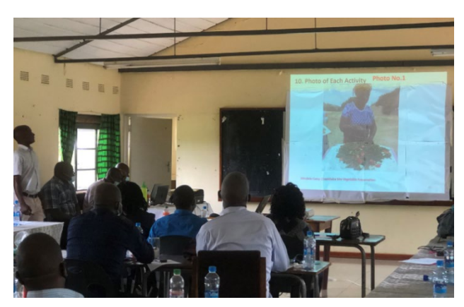
Representative of each district reported the achievement of annual activities and made discussion among the participants. (Copperbelt province)

Officers from Chisamba and Chibombo district visited the COBSI site in Mukshi district on 9<sup>th</sup> December (18 participants from Chisamba district, 20 participants from Chisamba district), and officers from Kapiri Mposhi district visited on 10<sup>th</sup> (42 participants from the district). The participants observed the actual situation of the COBSI site, e.g. simple weir, water flow, canal, and irrigated fields. Also, they asked the farmers about the activities of irrigation agriculture for a better understanding of the COBSI approach and the potential site.