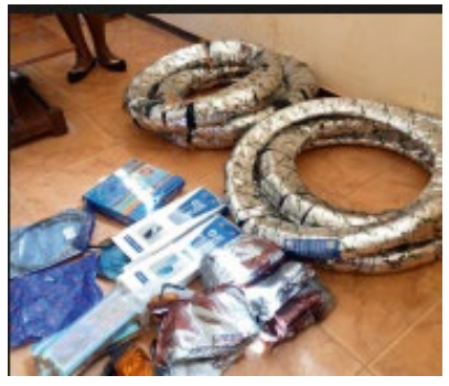
Motorbike spare parts were prepared by the CPU and some of them were given to CEO in AEW. (Central province)

It has been a big issue that many CEO in COBSI target area have problems with their motorbike and are unable to conduct COBSI activities or the government's extension service on time and sufficiently. To improve the situation, the project checked the current condition of the motorbike in each district and support the budget for the necessary spare parts to each provincial CPU. It is expected that E-COBSI activity will be accelerated by this support.