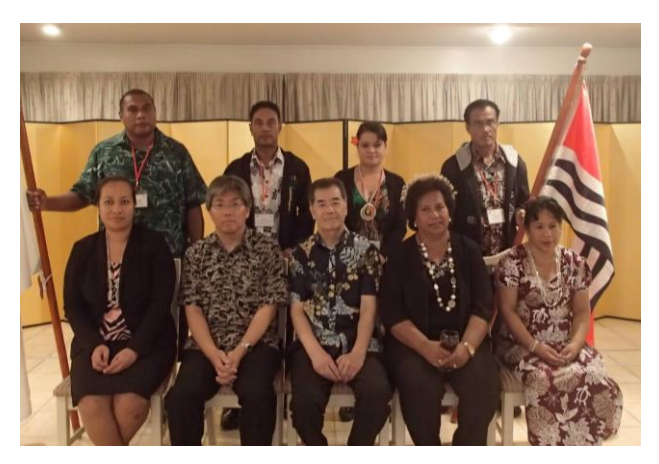
Dinner at the Japanese Embassy, Suva Fiji (2016)

Studying in Japan under the Pacific-LEADS program is a unique experience for me as I acquired new knowledge and skills which I could now utilize in my field/work. Upon commencing my duties at the Kiribati Teachers' College (my work place) I have the opportunity to employ and implement what I have gained in my program. With my know-how in the field research, I have been engaged in a number of research jointly initiated by the Ministry of Education and the Kiribati Education Facility (KEF). This research work has further lead me to be contracted by the Commonwealth of Learning (COL) as a Research, Monitoring and Evaluation (RM&E) Consultant to spearhead the Baseline Study at the senior secondary schools in Kiribati.