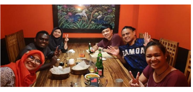
Making memories of Japan